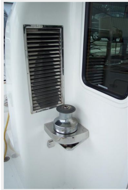
Electric Winch in Cockpit