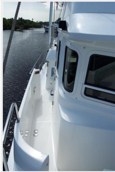
Starboard Side Deck Aft