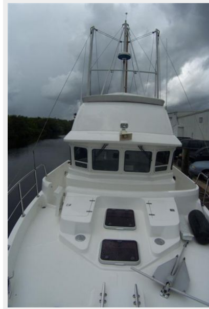
Foredeck and Cabin looking Aft