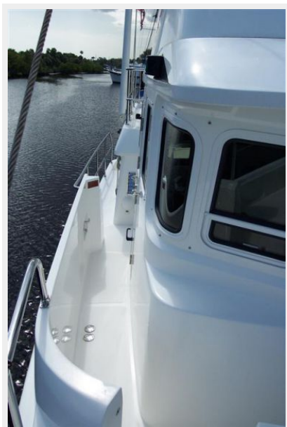
Starboard Side Deck Aft