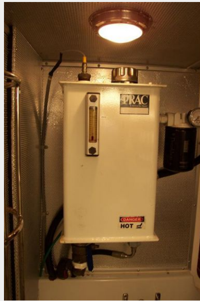
TRAC Power Unit