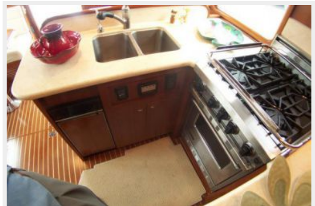
Galley Peninsula and Range