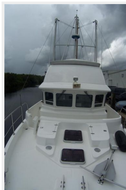
Foredeck and Cabin looking Aft