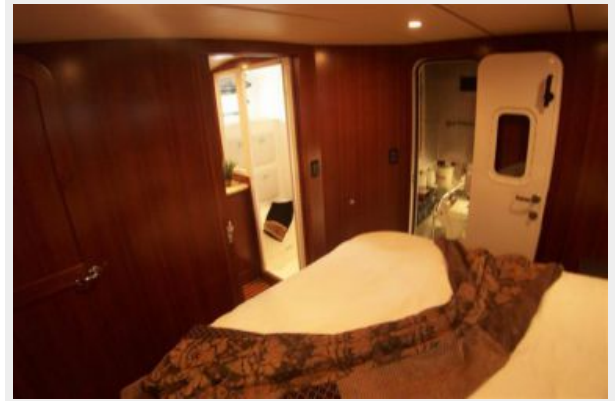
Master Stateroom Facing Aft Starboard