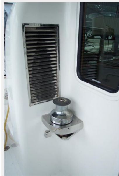
Electric Winch in Cockpit