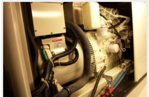
Northern Lights Genset