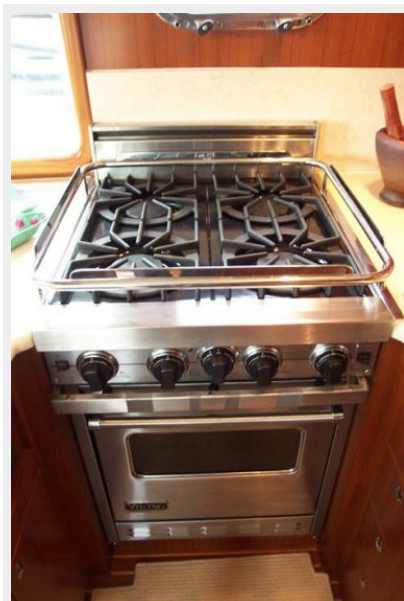
Viking Range and Oven