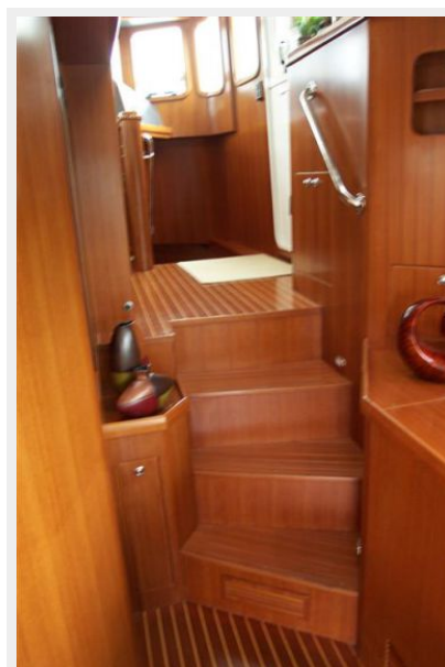
Steps from Saloon to Pilothouse