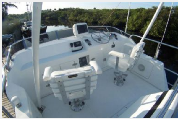
Flybridge Helm Forward