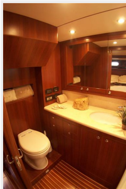
Master Ensuite Head