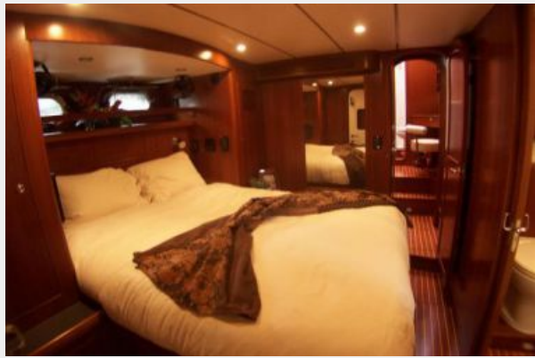
Master Stateroom Looking Forward