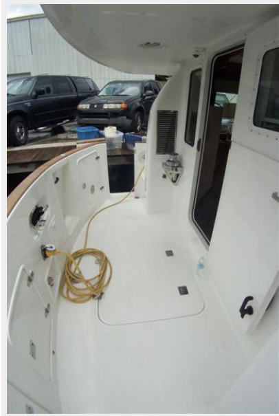
Cockpit to Port