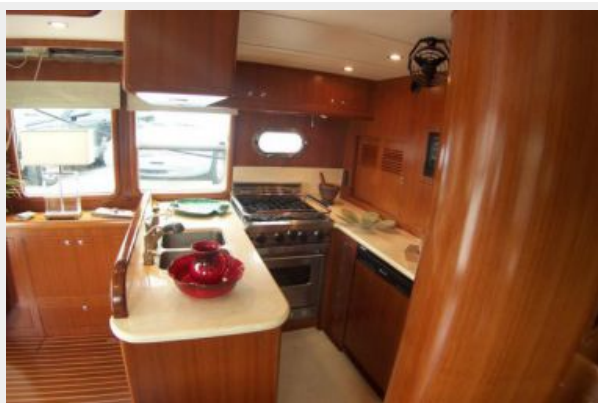
Galley to Port