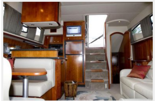
Entry to Cabin