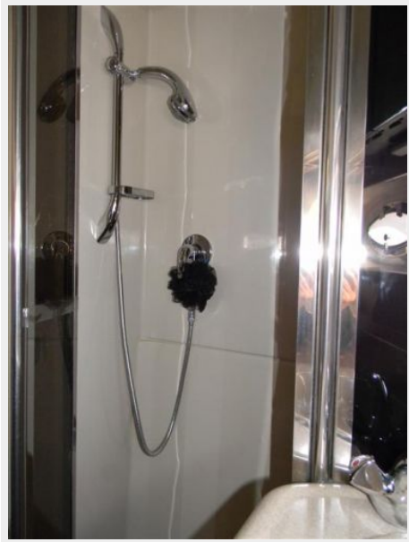
Master Shower Stall