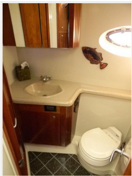
Guest En Suite Head