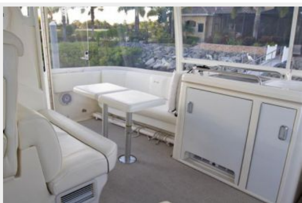
Aft Bridge Seating