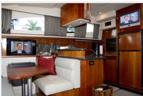
Dinette and Galley