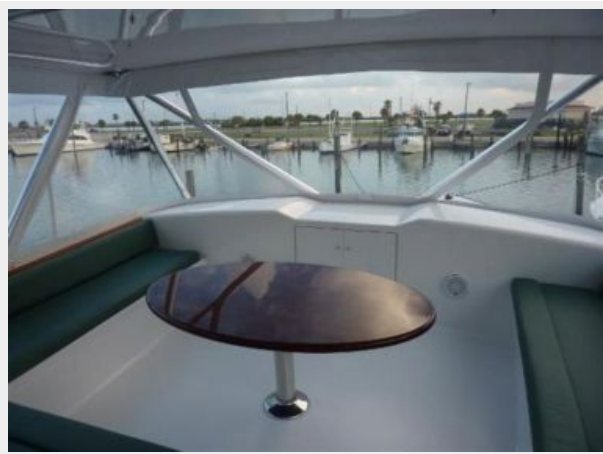
Flybridge Seating and Table