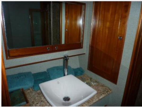
Master Head with New Granite, Sink and Faucet