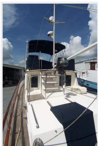
Trunk Cabin Forward