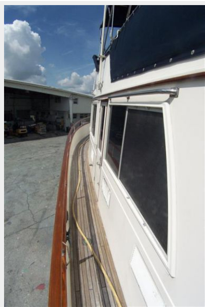
Port Side Deck Forward