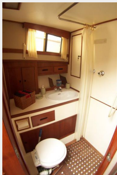
Master Ensuite Head to Port