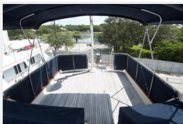
Flybridge Aft Deck