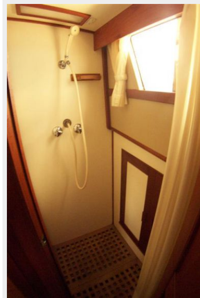
Master Stateroom Shower to Starboard