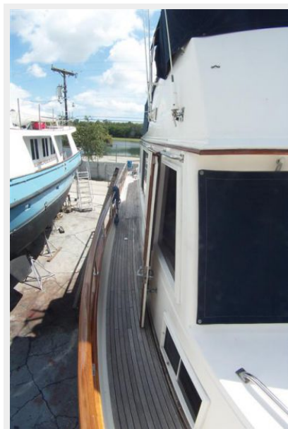
Starboard Side Deck Aft