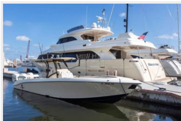
NORTH STAR 86' Ferretti with Tender