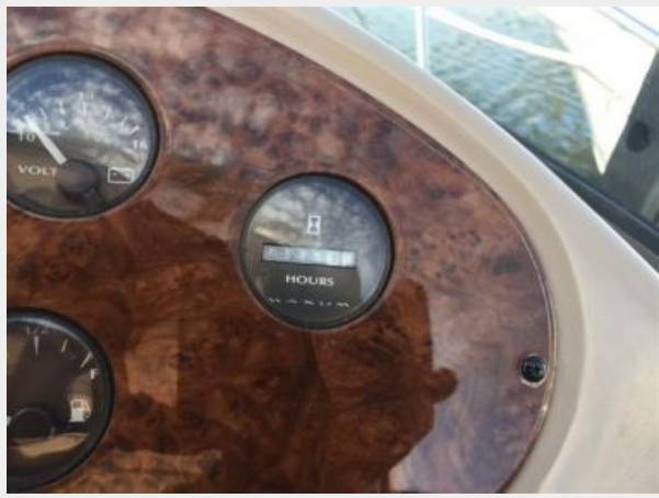
Stbd Hour Meter