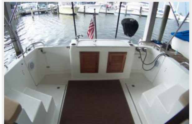
Cockpit with Transom Door