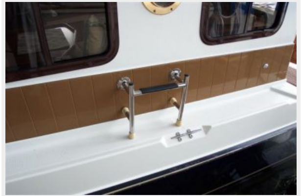
Removable Step to Reach Cabin Top