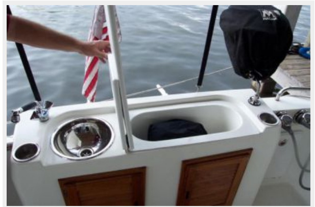
Sink, Cooler, Magma Grill