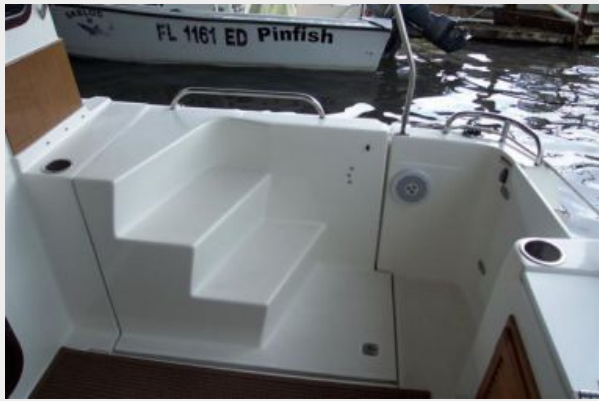
Cockpit to Starboard