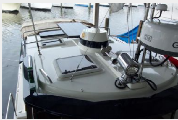
Cabin Top View Aft