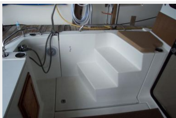
Cockpit to Port