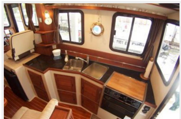
Galley to Starboard - Cooking with a Great View