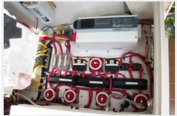
Charger/Inverter DC Switches, Water Heater