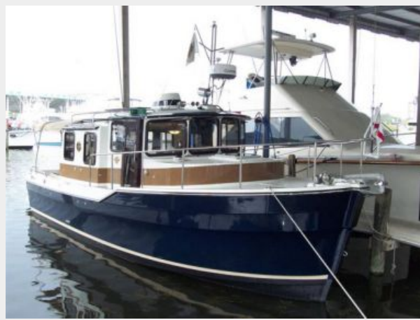
Covered Slip Since New