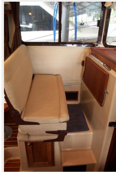
Helm to Starboard with Deck Access