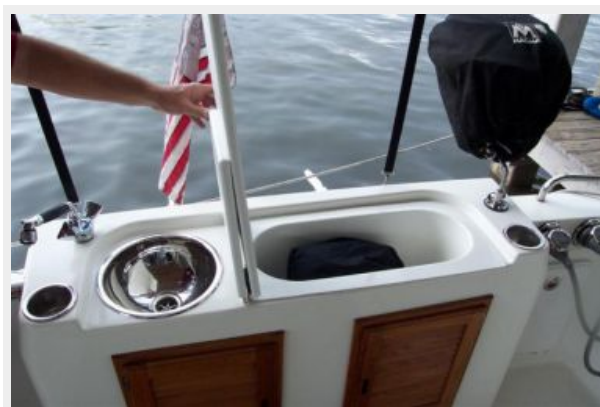
Sink, Cooler, Magma Grill