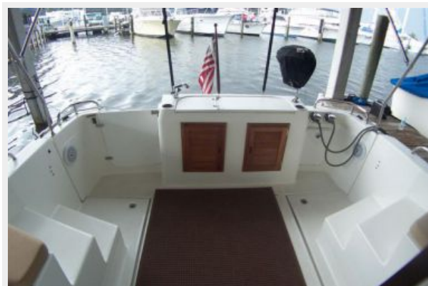
Cockpit with Transom Door