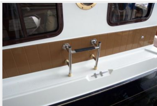
Removable Step to Reach Cabin Top