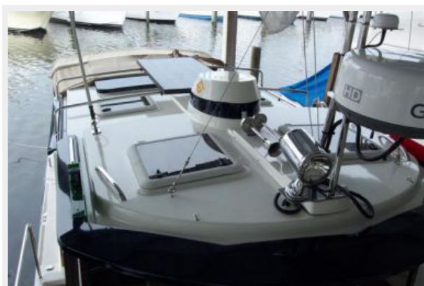
Cabin Top View Aft