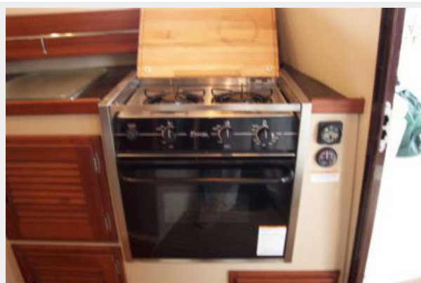
Two Burner Propane Stove/Oven