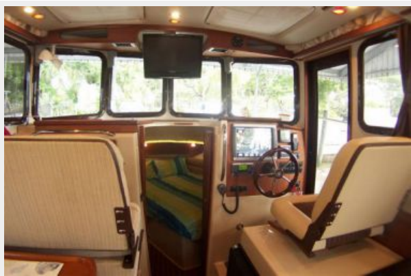
Helm Area with Great Visibility