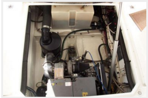
Yanmar - Clean Engine Room