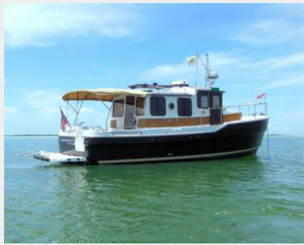
Happy at Anchor!