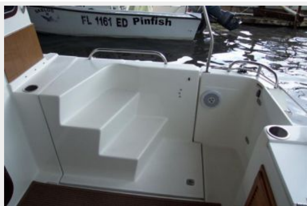
Cockpit to Starboard