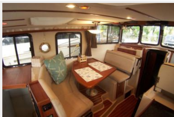
Convertible Dinette to Port