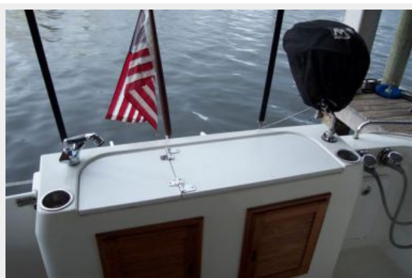
Cockpit Convenience Center