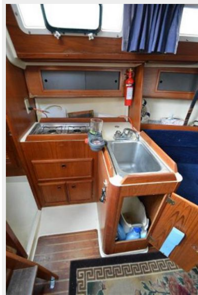
28 Pearson, Clean and Functional Galley