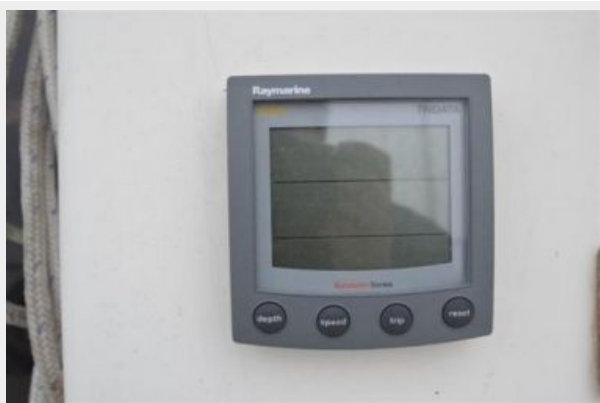
28 Pearson, Depth Finder