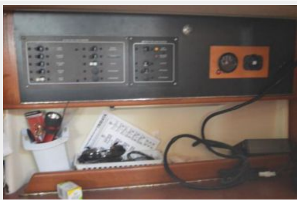
28 Pearson, Breaker Panel, Fuel Gauge, and 12v Cabin Outlet