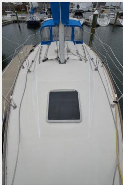
28 Pearson, Looking Aft