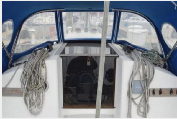
28 Pearson, Cabin Entrance