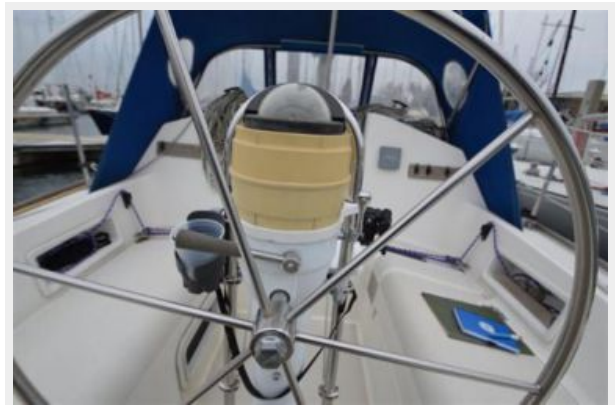
28 Pearson, Engine Controls