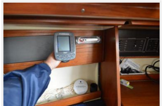
28 Pearson, New GPS and Stereo