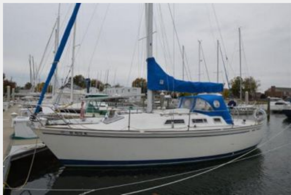
28 Pearson, Port Bow