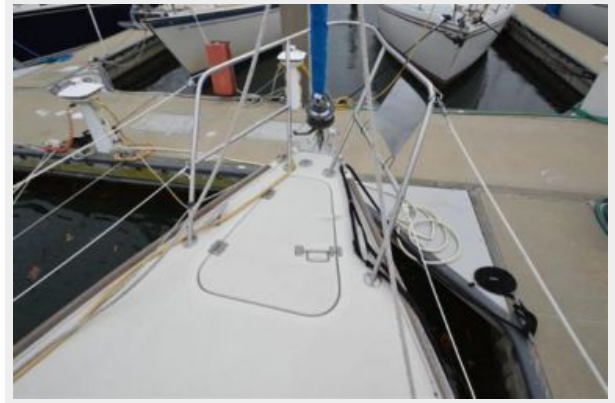
28 Pearson, Anchor Locker