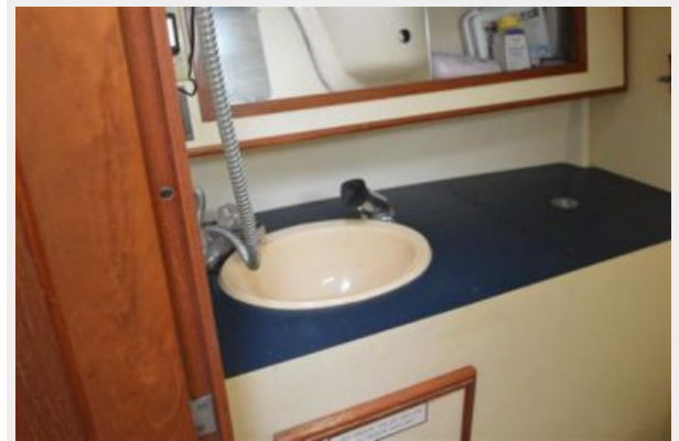
28 Pearson, Clean and Functional Galley