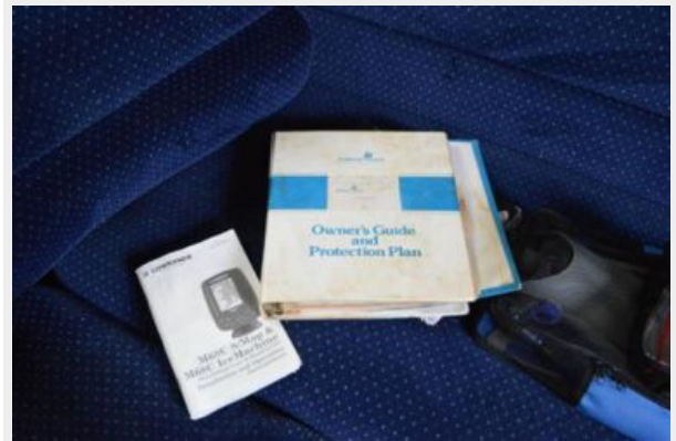
28 Pearson, Owner's Manuals