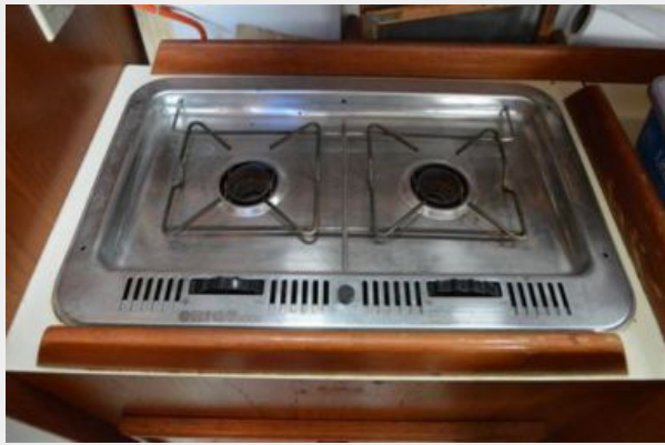
28 Pearson, 2 Burner Alcohol Stove