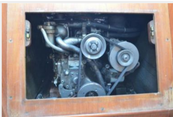
28 Pearson, 18hp Diesel Engine