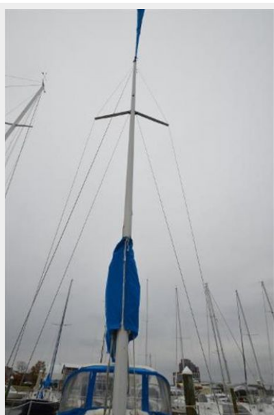
28 Pearson, Looking Up