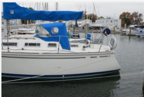
28 Pearson, Bimini Dodger