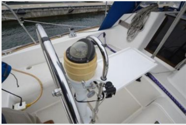
28 Pearson, Folding Cockpit Table