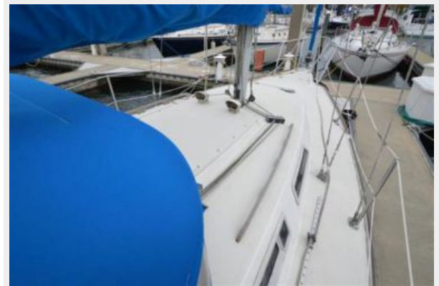
28 Pearson, Foredeck