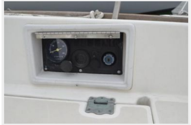
28 Pearson, Engine Panel