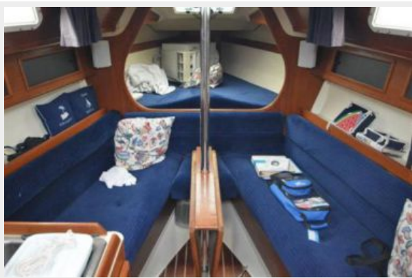
28 Pearson, Clean, Comfortable Cabin