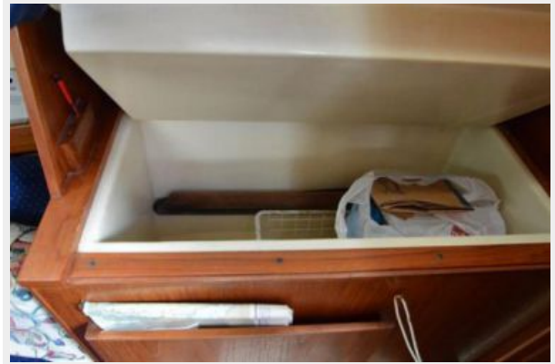
28 Pearson, Built in Cabin Ice Box