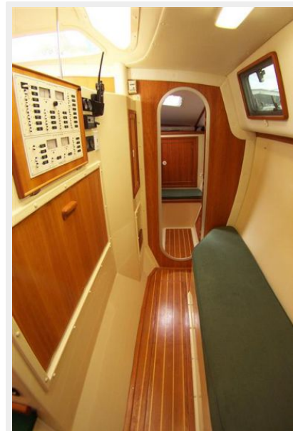
Starboard Pontoon Forward