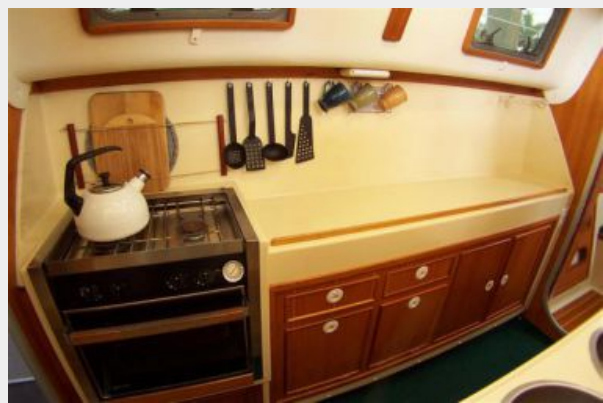
Force 10 Propane Two Burner Stove/Oven