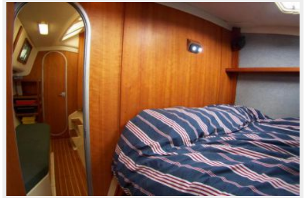
Master Stateroom looking Aft