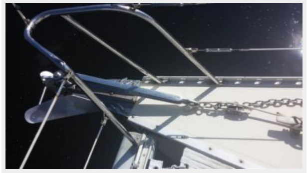
New Hinges SS Bruce Anchor