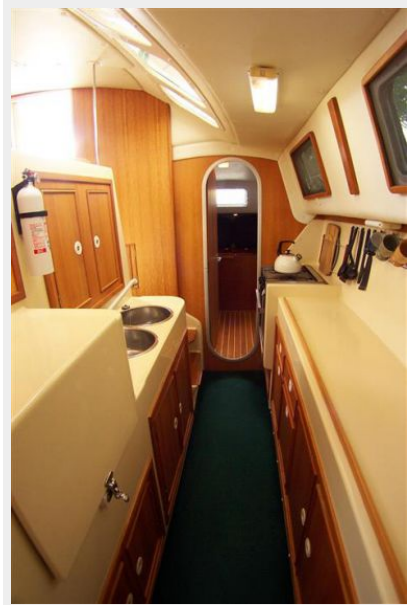
Galley View Aft