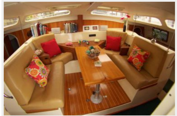
Starboard Pontoon Forward