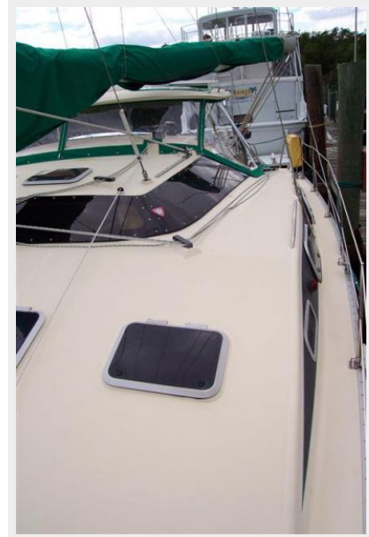
Port Side Deck Aft