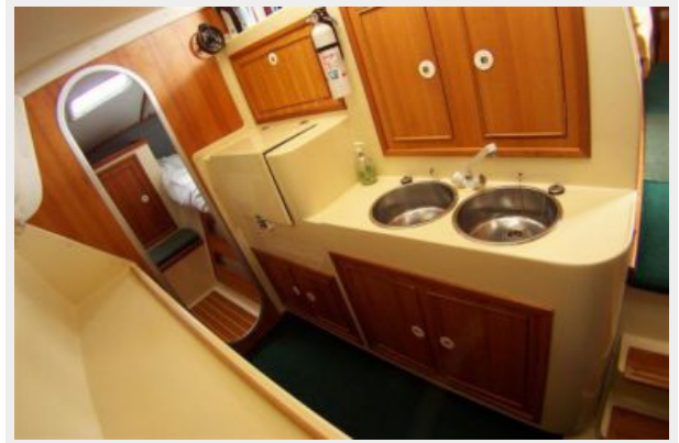
Double SS Sinks