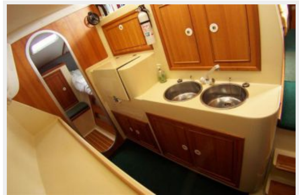
Double SS Sinks