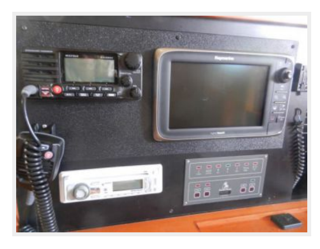
Starboard salon looking aft