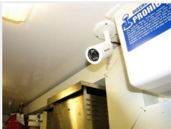
Engine & Mechanical Equipment 10 - Engine Room Camera