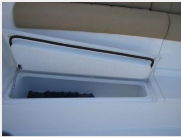
Deck 8 - Mezzanine Storage