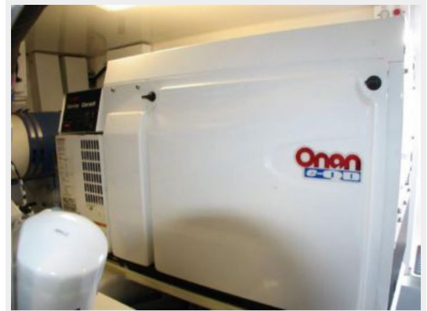
Electrical System / Equipment - Generator