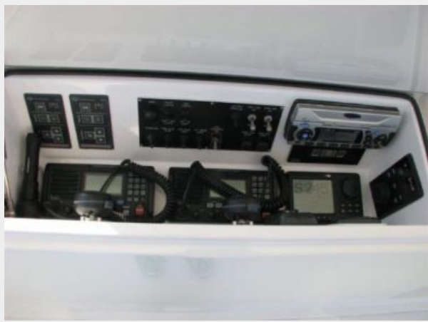
Helm / Electronics & Navigation 6 - Radio Box