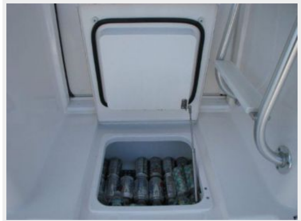
Deck 9 - Refrigerated Drink Box