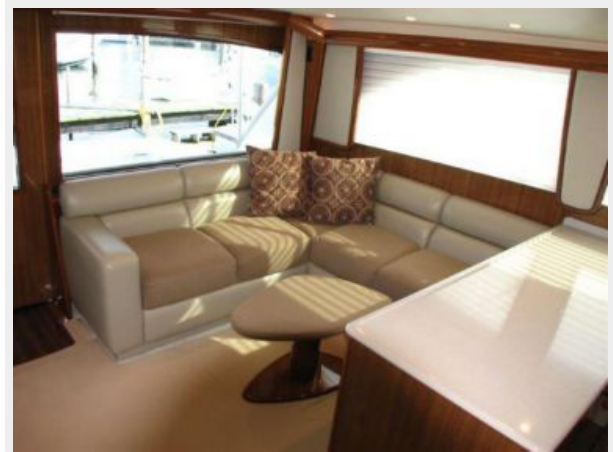
Salon 2 - Sofa