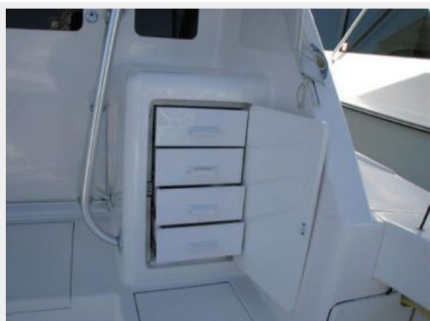
Cockpit / Fishing Equipment 3 - Tackle Storage