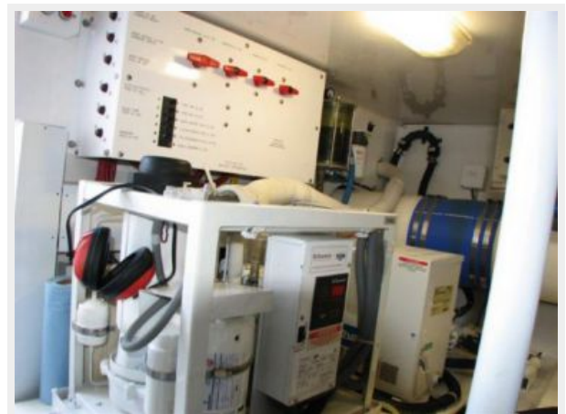
Engine & Mechanical Equipment 5 - Engine Room