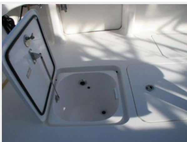
Deck 10 - Port Deck Storage w/ Ice Chipper Outlet