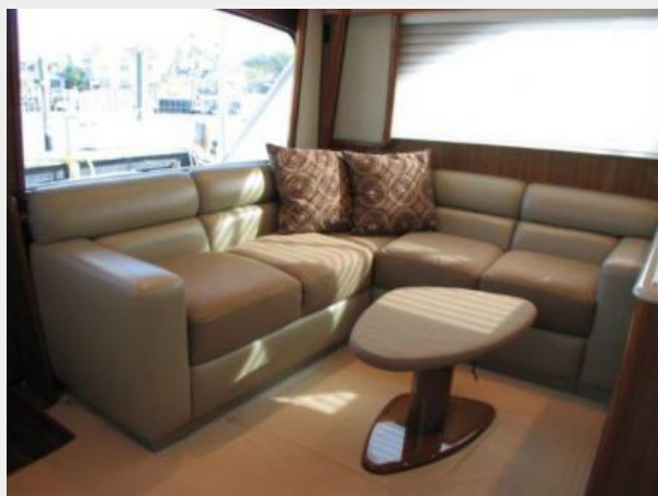
Salon 1 - Sofa