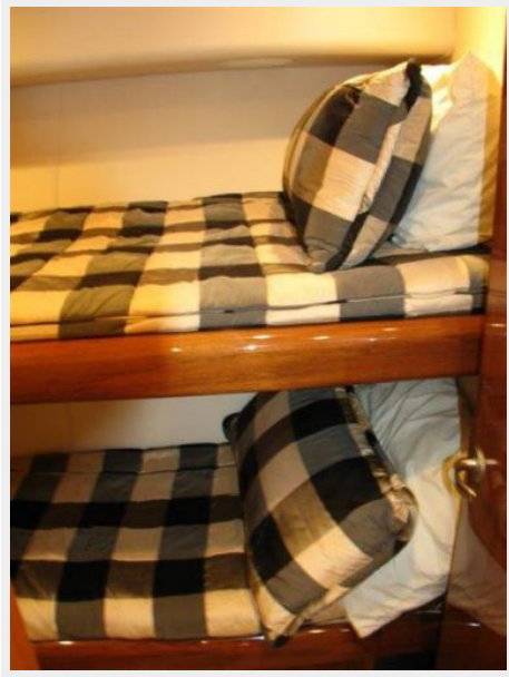
Guest Stateroom, Amidship Starboard 1