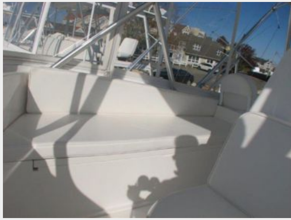
Deck 6 - Starboard Bridge Seating