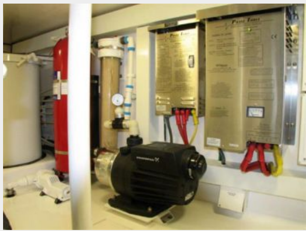
Engine & Mechanical Equipment 8 - Engine Room