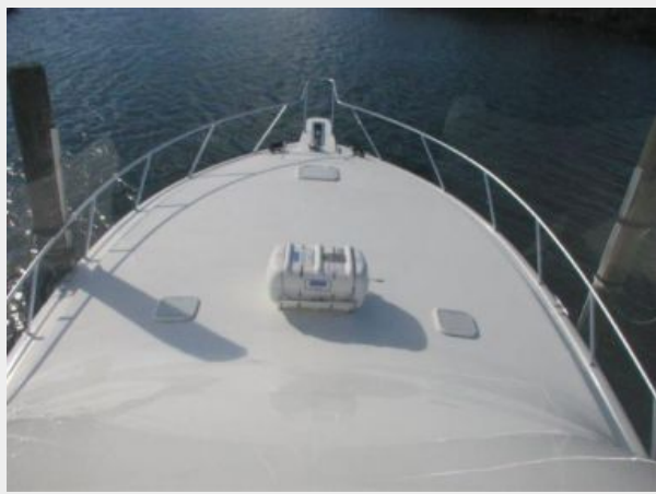
Deck 2 - Bow