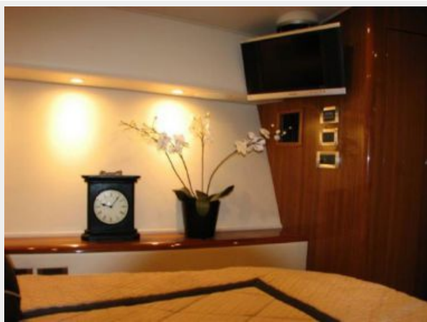
Master Stateroom 3