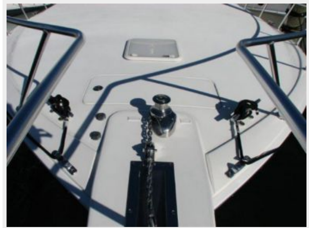
Deck 1 - Windlass