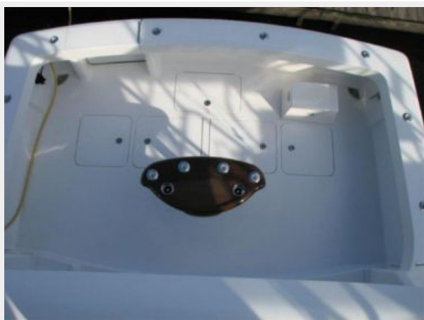
Cockpit / Fishing Equipment 1