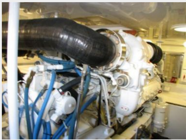
Engine & Mechanical Equipment 2 - Port Engine