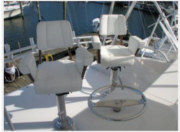
Deck 7 - Helm Seats