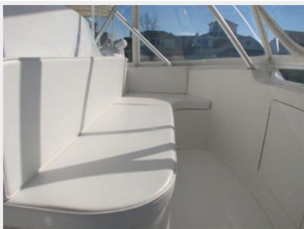
Deck 4 - Forward Bridge Seating