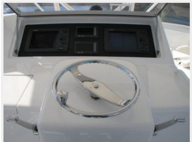
Helm / Electronics & Navigation 3