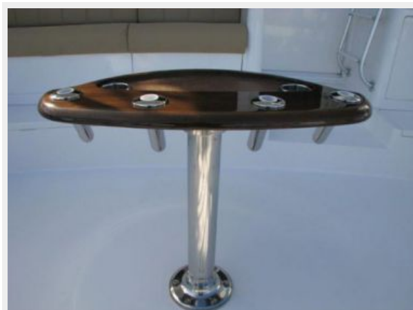
Cockpit / Fishing Equipment 4 - Rocket Launcher