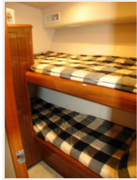
Guest Stateroom, Amidship Starboard 2