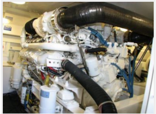
Engine & Mechanical Equipment 3 - Starboard Engine