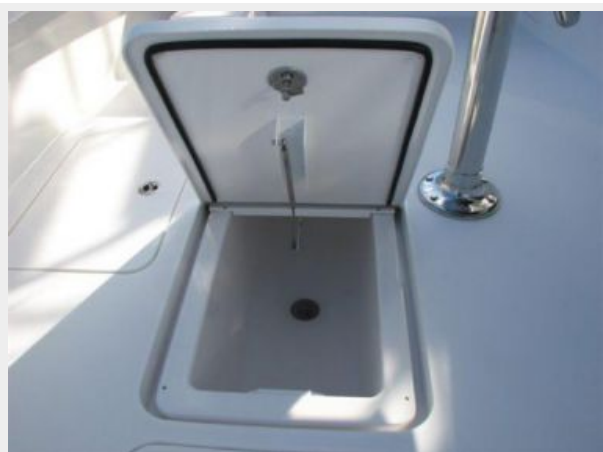
Cockpit / Fishing Equipment 5 - Fish Box