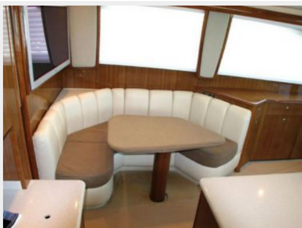
Salon 3 - Dinette