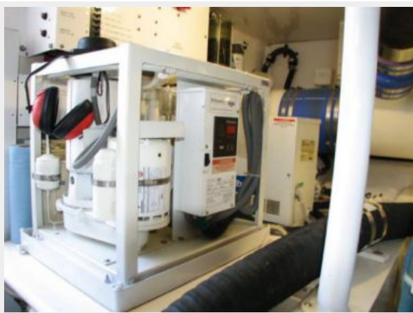
Engine & Mechanical Equipment 6 - Ice Chipper