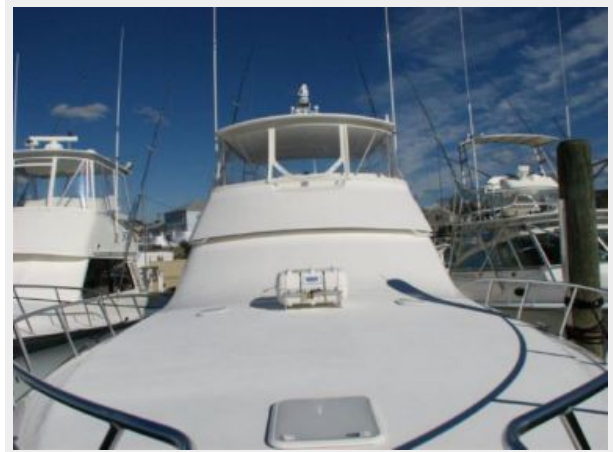
Deck 3 - View From Pulpit