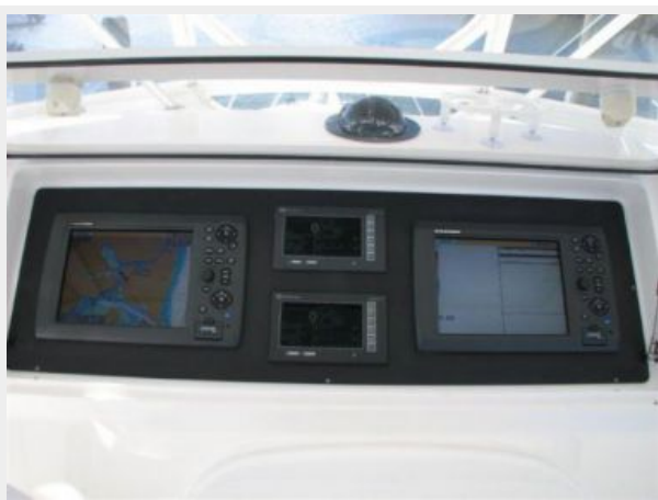
Helm / Electronics & Navigation 4 - Electronics