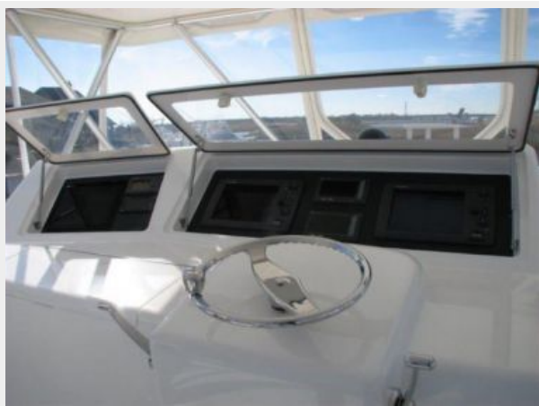
Helm / Electronics & Navigation 2