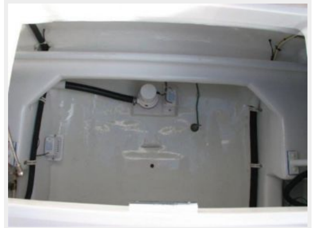
Engine & Mechanical Equipment 9 - Aft Bilge