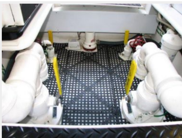
Engine & Mechanical Equipment 4 - Engine Room