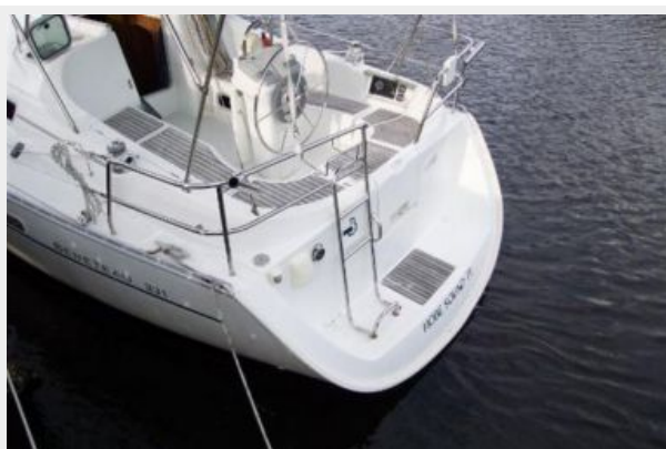
Stern view / Swim Ladder