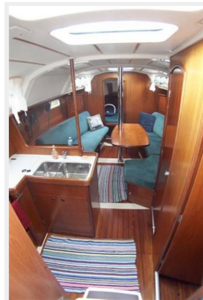
View forward from Companionway