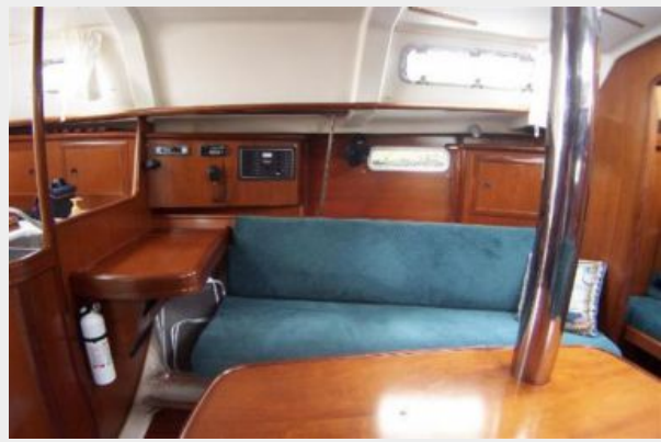
Settee to port