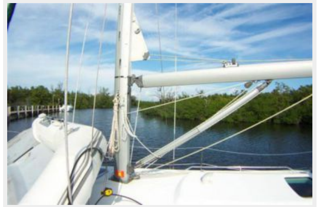
Rigid Boom Vang