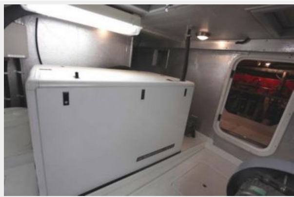
Engine room generator