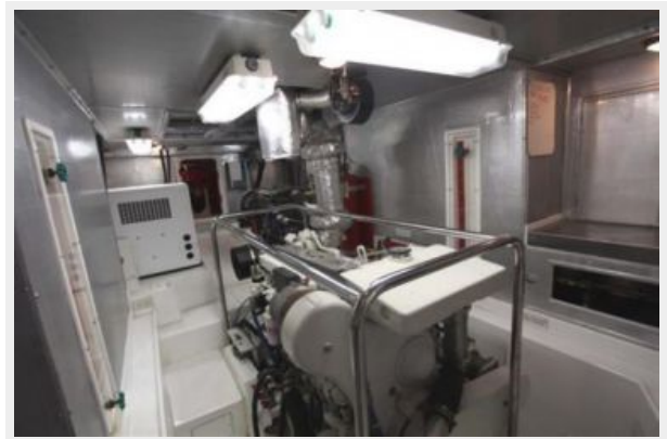
Engine room looking aft