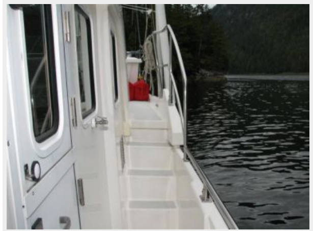
Boat deck stairs to port