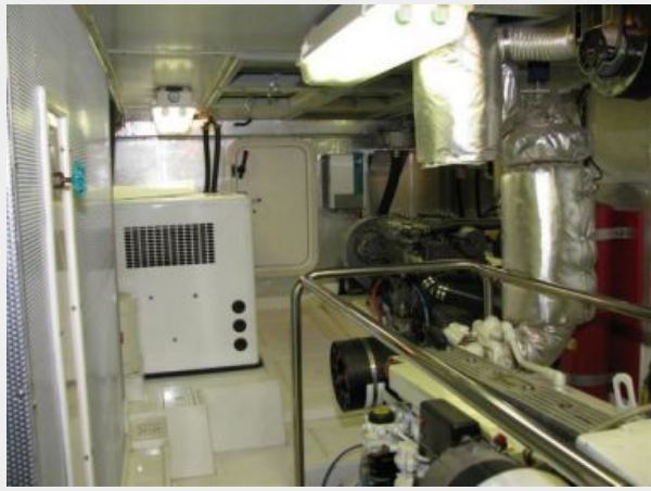
Engine room - starboard aft view