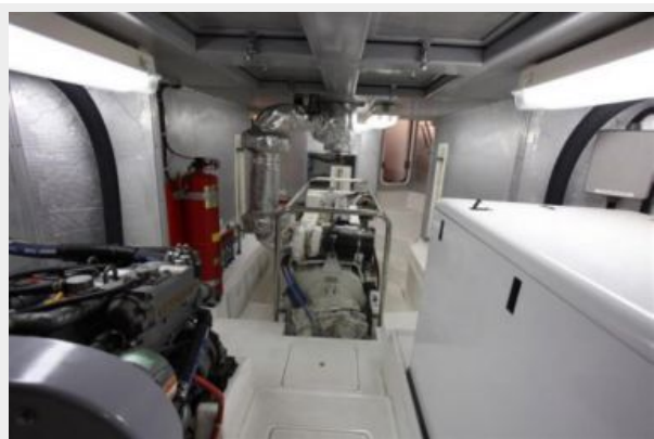
Engine room looking forward