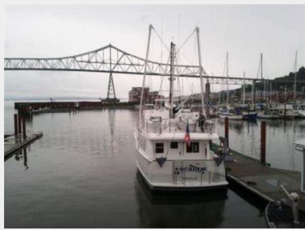
Arcadia II in port