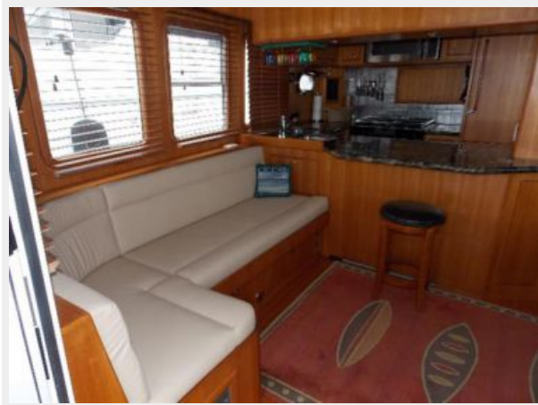
Saloon port side