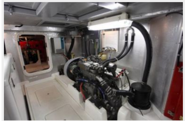
Engine room - wing engine