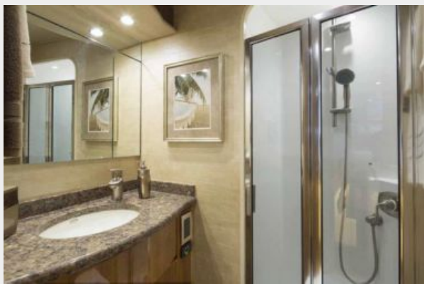
Sistership Master Head