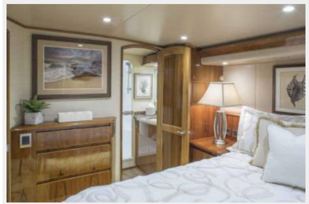
Sistership Master Stateroom Head Entry