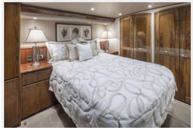
Sistership Master Stateroom