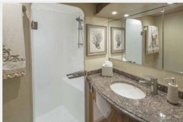
Sistership Master Head