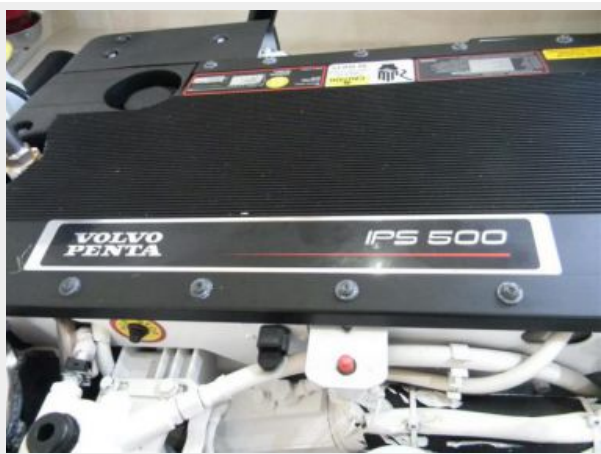
Volvo IPS 500