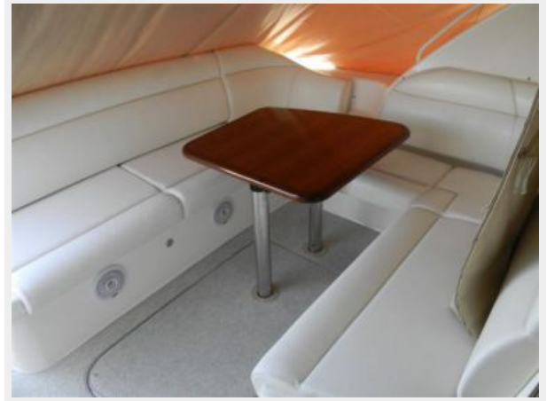
Cockpit Seating and Table