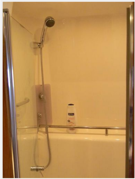
Separate Shower Stall