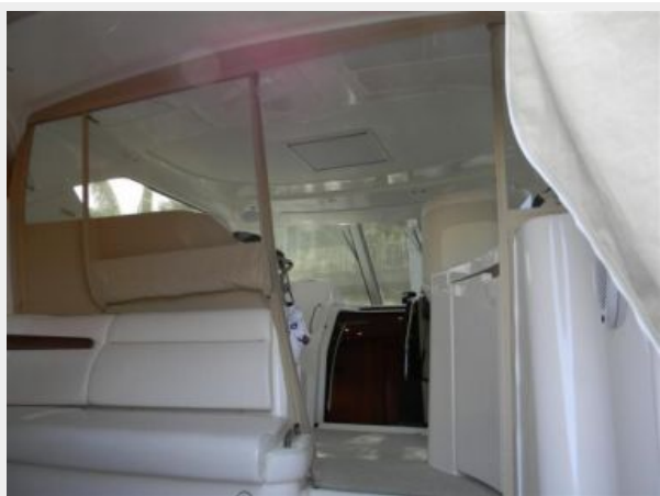
Custom Drop Curtain