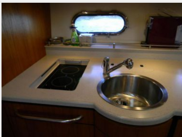
Galley Sink and Stove