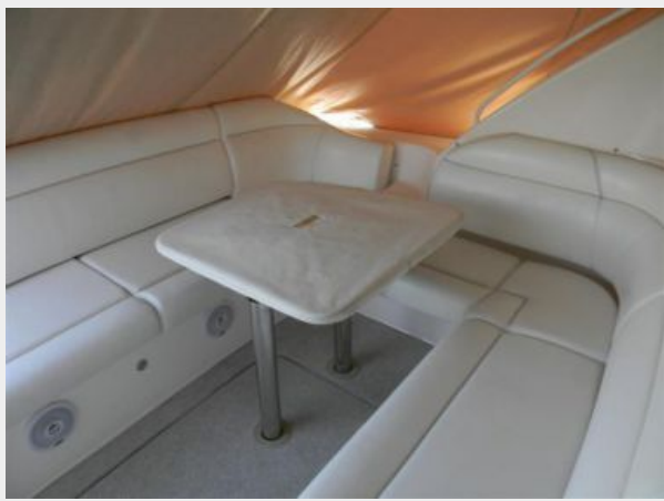
Cockpit Table with Cover