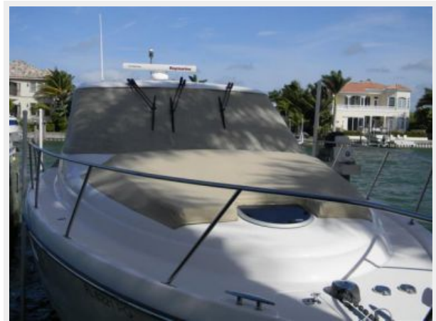
Foredeck Sunpad and Windshield Cover