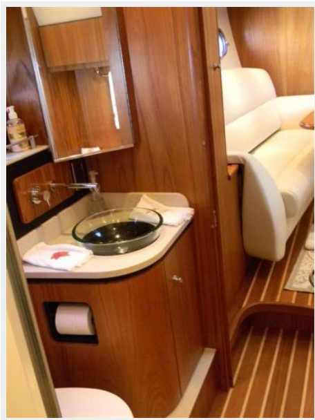
Head and Vanity