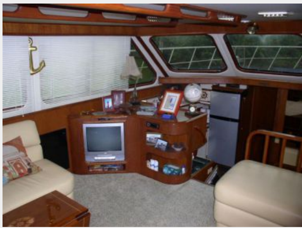
Main salon, fwd