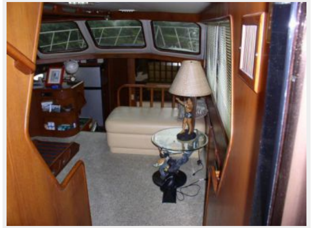
Main salon, entering