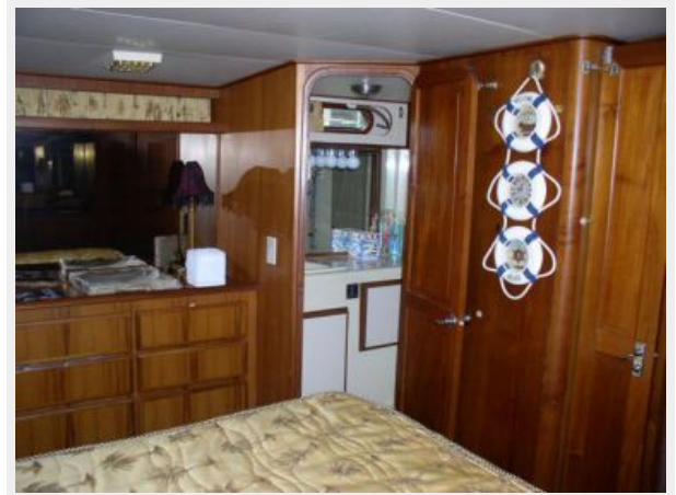
MSR, ensuite head