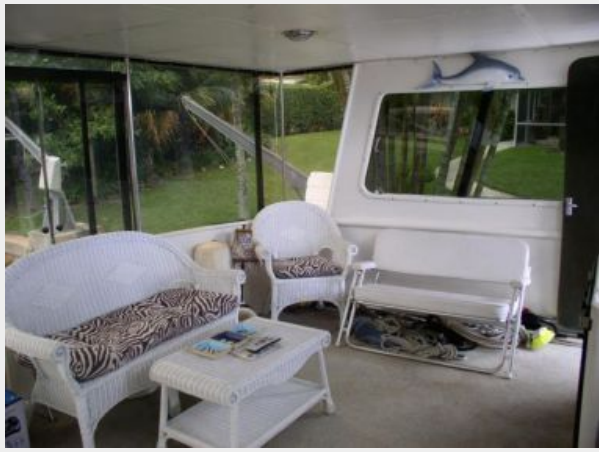
Aft deck, port