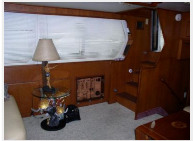
Main salon, stbd