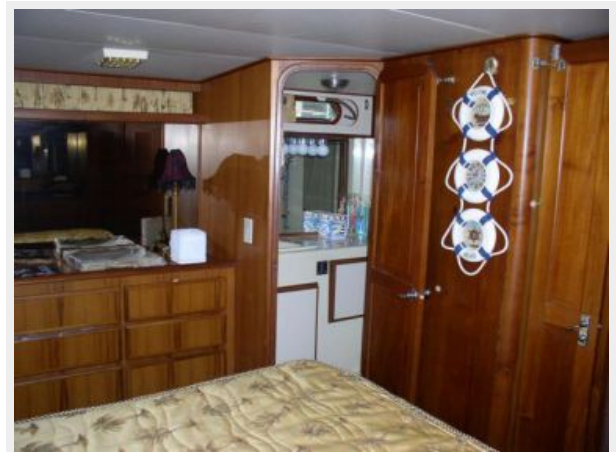
MSR, ensuite head