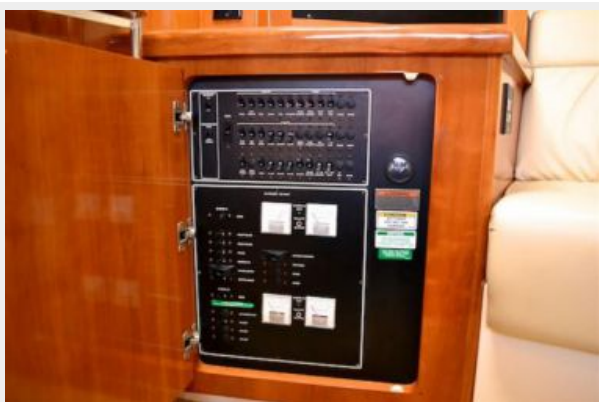
Salon Main Distribution Panel