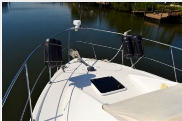
Hull & Deck