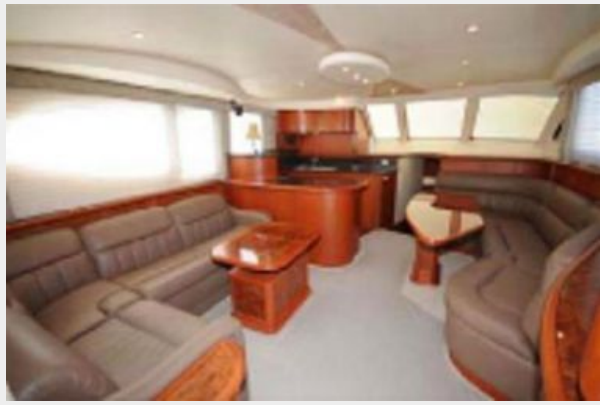
Salon / Galley Looking Forward