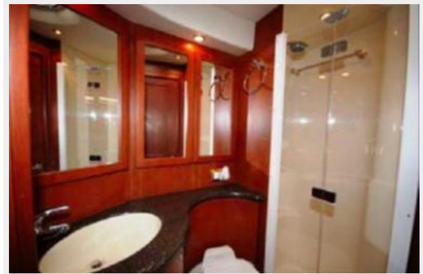
Master Stateroom Head / Shower