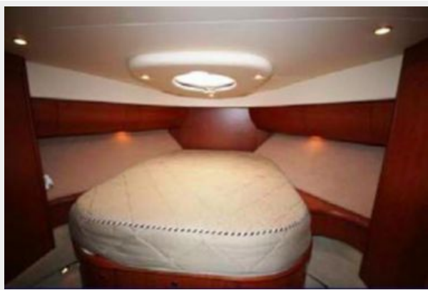
Forward VIP Stateroom