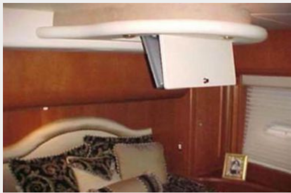
Master Stateroom / Flat Screen Fold Down