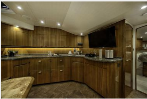
Sistership - Galley