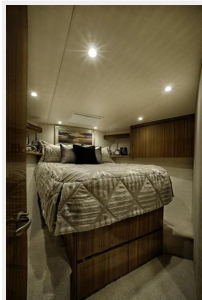
Sistership - Master Stateroom