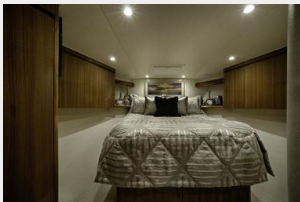
Sistership - Master Stateroom