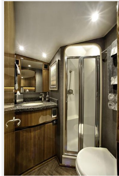
Sistership - Head