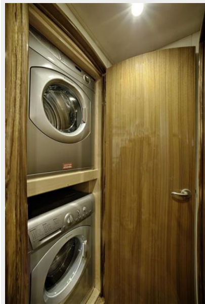
Sistership - Washer/Dryer