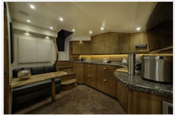
Sistership - Dinette/Galley