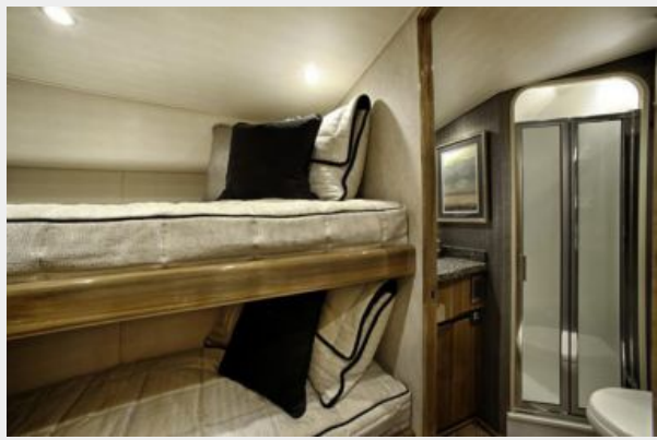
Sistership - Stateroom/Head