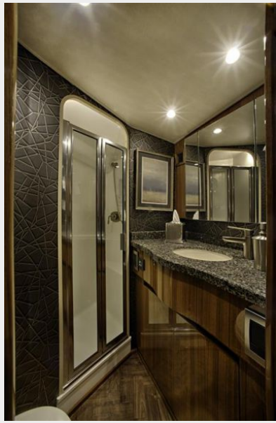
Sistership - Master Head