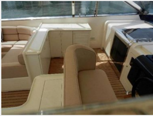
Main Deck Seating