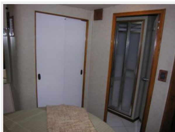
VIP Stateroom Additional Hanging Locker & Head Access