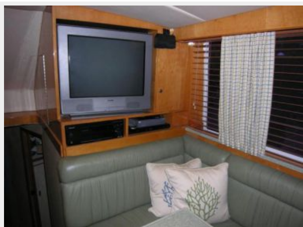
Starboard Salon Forward