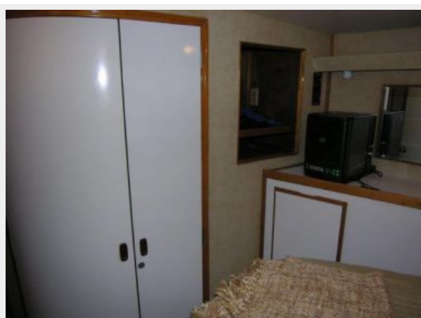
VIP Stateroom Hanging Locker