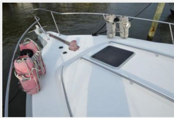
345 Sea Ray Sedan Bridge, pulpit and anchor windlass