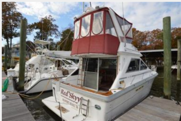
345 Sea Ray Sedan Bridge, stainless water heater