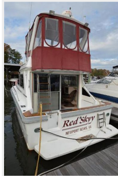
345 Sea Ray Sedan Bridge, port stern