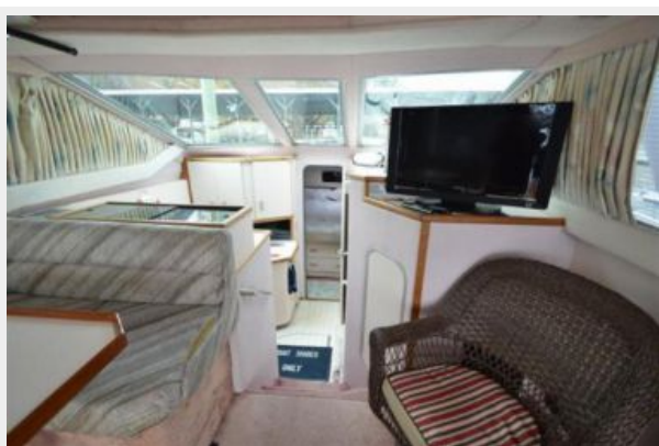
345 Sea Ray Sedan Bridge, 26" HDTV in salon