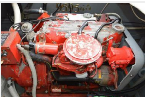
345 Sea Ray Sedan Bridge, 8.5kw Westerbeake gas generator