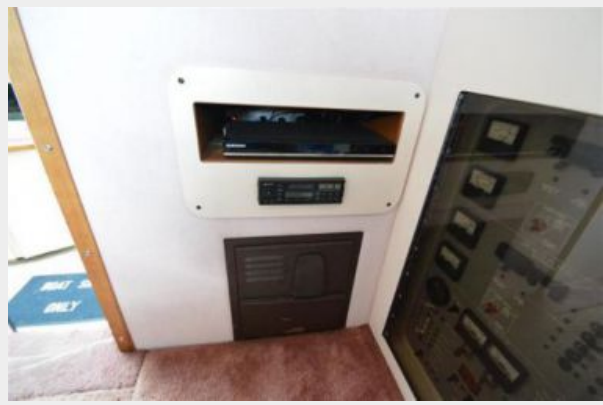
345 Sea Ray Sedan Bridge, Samsung DVD Player, Sony Stereo, Central Vacuum