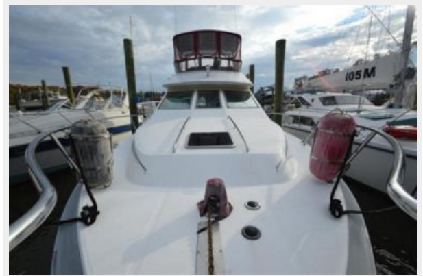
345 Sea Ray Sedan Bridge, looking aft