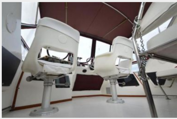
345 Sea Ray Sedan Bridge, looking up to flybridge