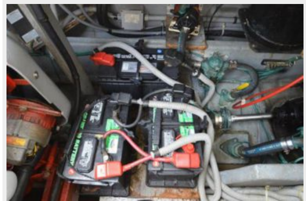
345 Sea Ray Sedan Bridge, all batteries replaced 07/2014