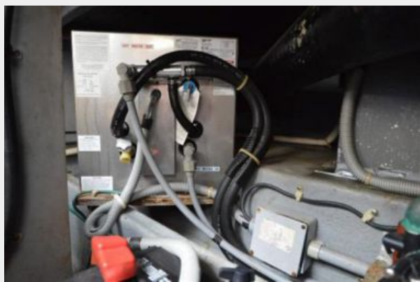
345 Sea Ray Sedan Bridge, stainless water heater