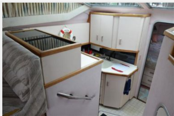
345 Sea Ray Sedan Bridge, looking into the galley