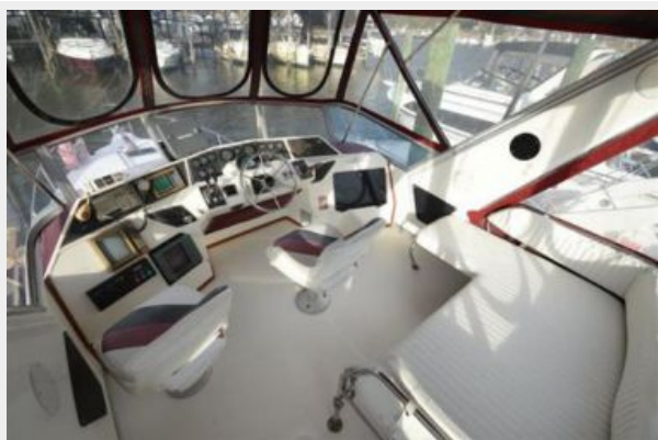
345 Sea Ray Sedan Bridge, flybridge overall