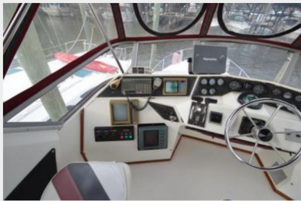
345 Sea Ray Sedan Bridge, navigation equipment