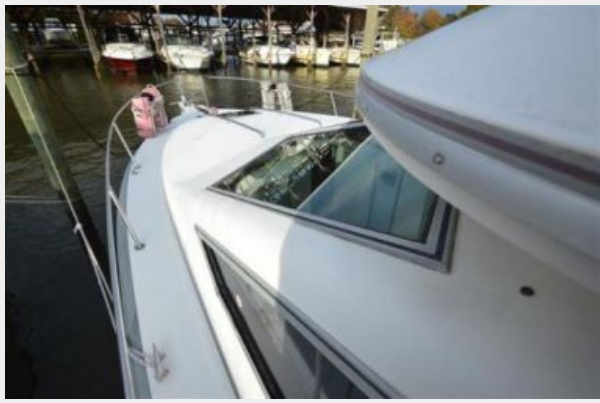
345 Sea Ray Sedan Bridge, port side walk