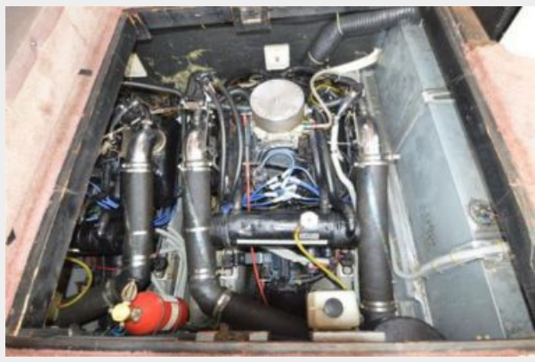
345 Sea Ray Sedan Bridge, 2009 big block 385hp FWC engines