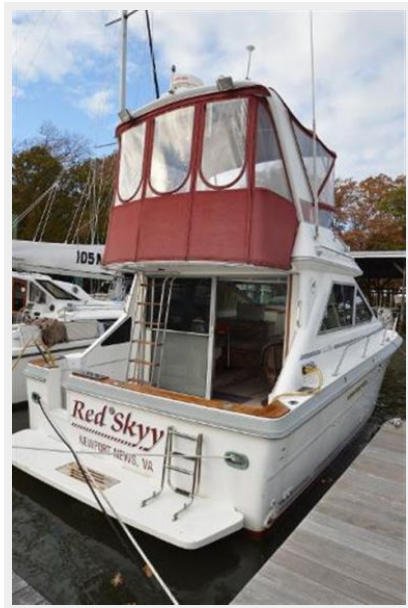
345 Sea Ray Sedan Bridge, stbd stern