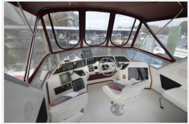
345 Sea Ray Sedan Bridge, flybridge pedestal seating