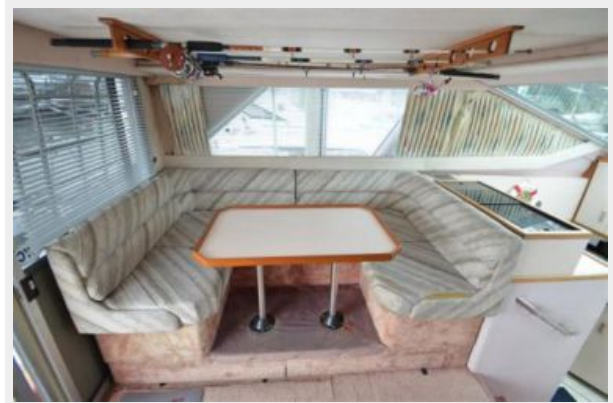
345 Sea Ray Sedan Bridge, dinette converts to sleeper