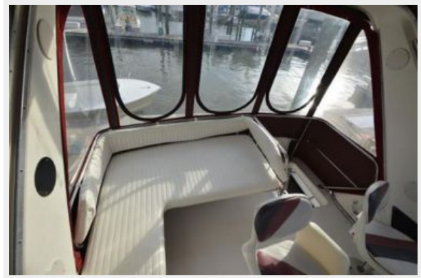
345 Sea Ray Sedan Bridge, new flybridge upholstery