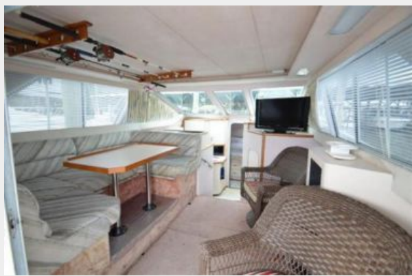
345 Sea Ray Sedan Bridge, bright, open salon