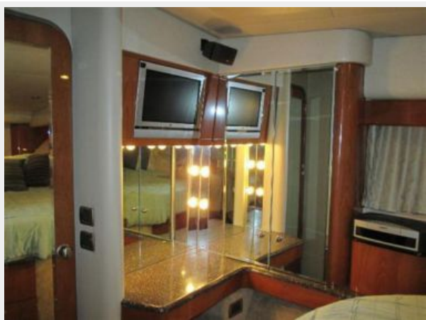
Master Stateroom Lighted Vanity