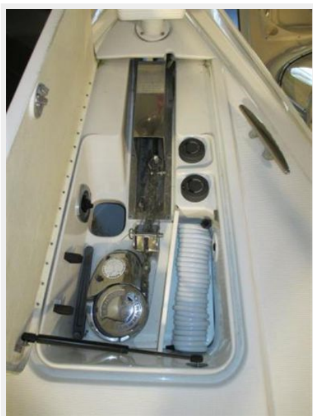
Windlass and bow wash down