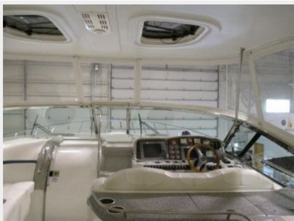
Helm Looking Forward