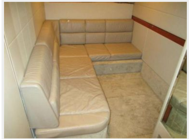
Mid-Ship Berth adjustable to full sized