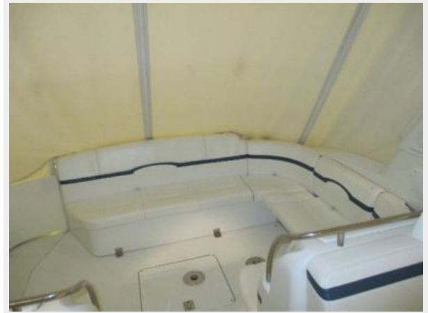
Cockpit looking Aft