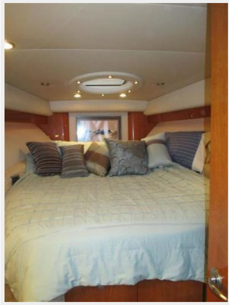
Master Statroom Pedestal Bed