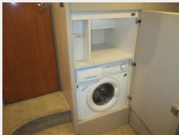
Washer and Dryer combo