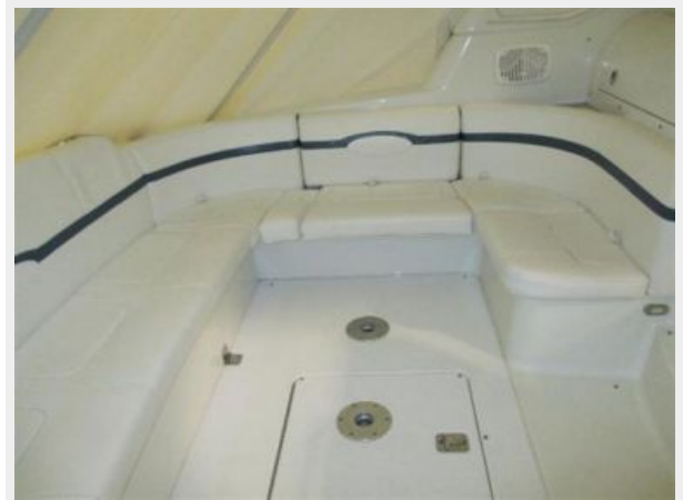
Cockpit facing Port