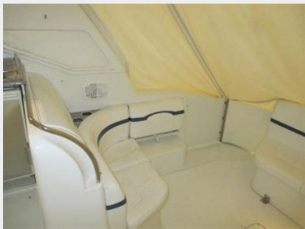
Cockpit looking Starboard