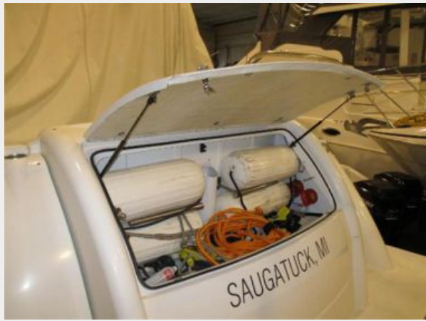
Swim Platform Storage