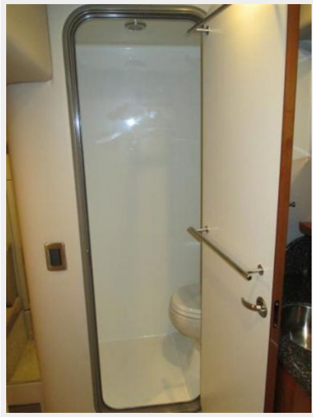
Mid-ship Stateroom Head