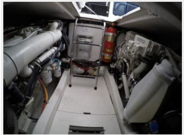
Engine Room - Facing Forward