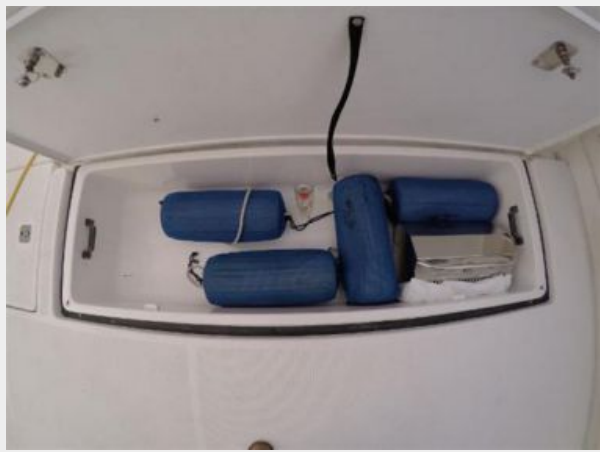
Cockpit Fish Box