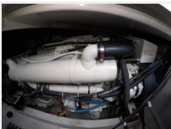
Port Main Engine