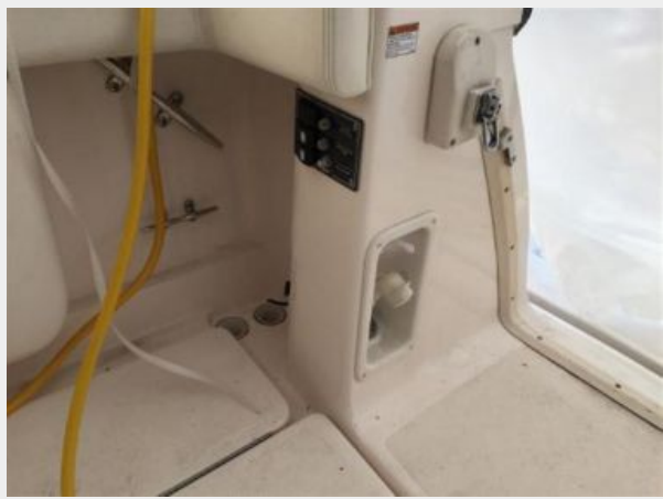
Starboard Transom Door / Fresh Water Shower