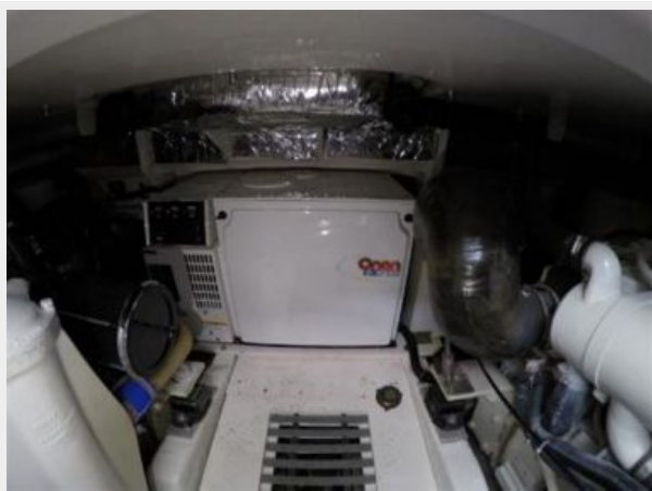
Onan Generator - Aft