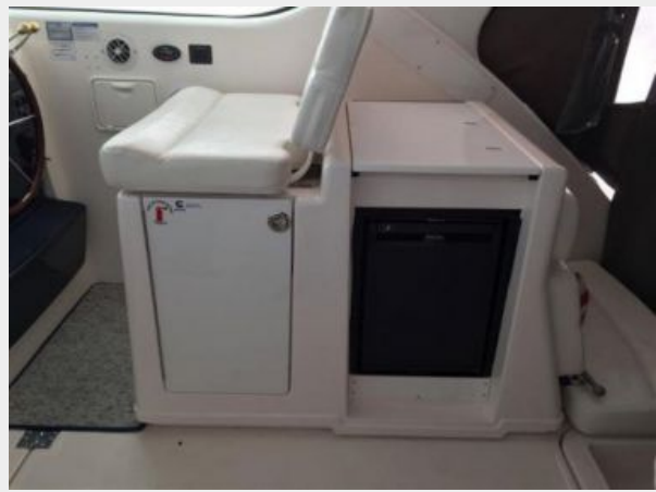
Starboard Wet Bar