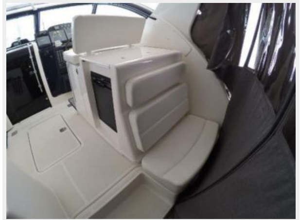
Starboard Rear Facing Seats