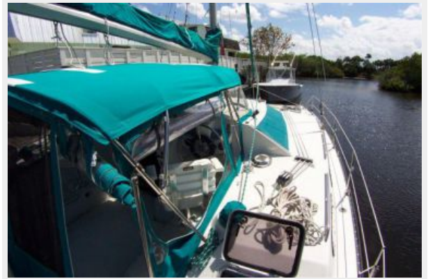
Starboard Side Deck