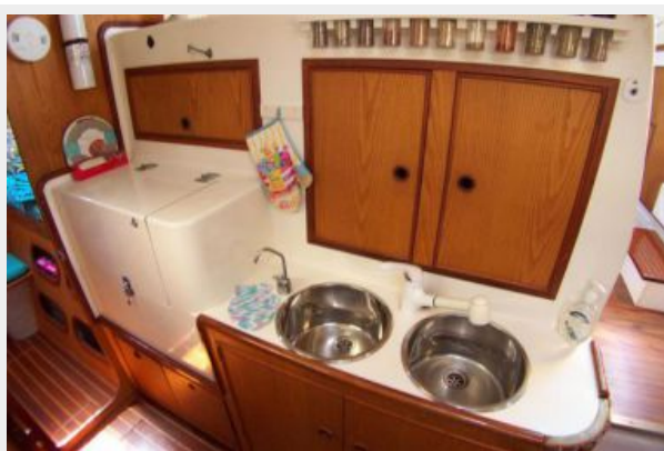
Double SS Sinks