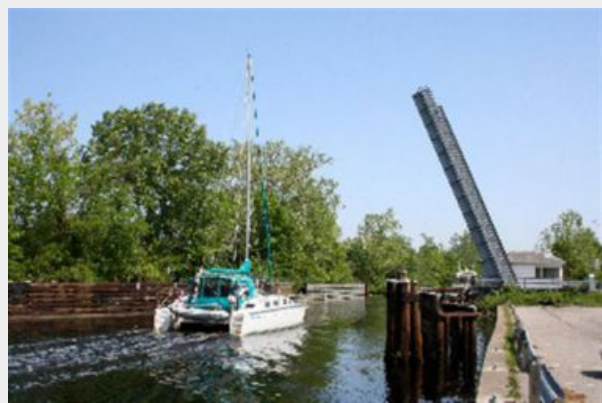
Traveling the Dismal Swamp