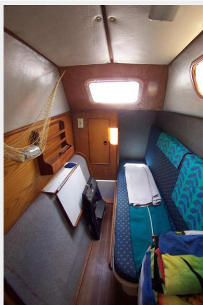
Office/Bunk Beds Port Side Aft