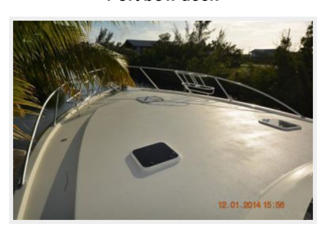
Port bow deck