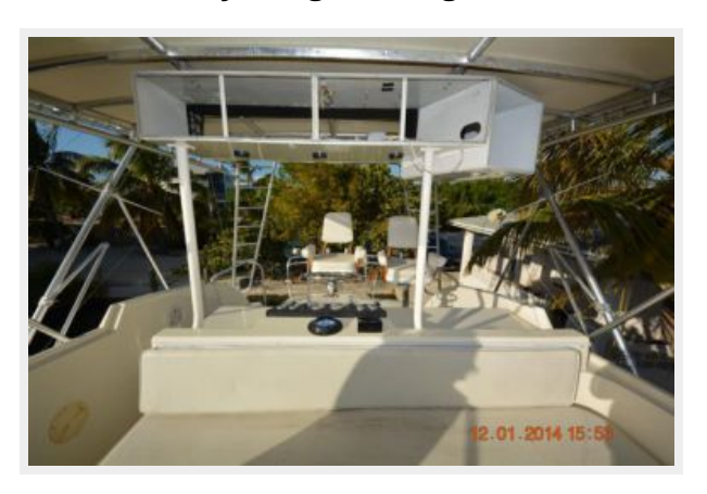
Flybridge facing aft