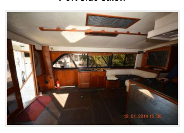
Port side salon