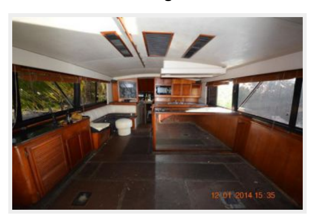
Salon facing forward