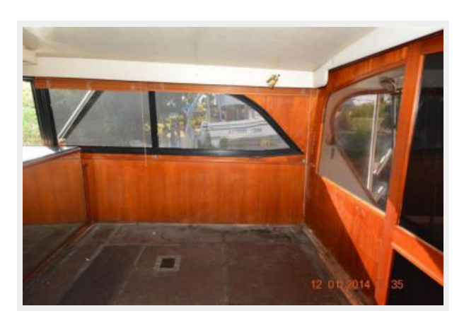
Starboard side salon