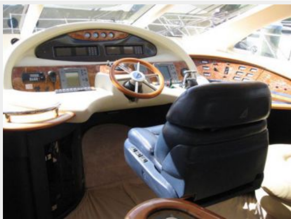
Lower Helm Controls