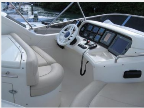
Upper Helm Controls