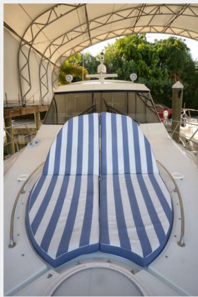
Bow Sun Pad