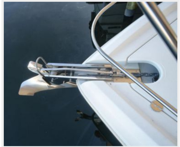
Bow Stainless Steel Anchor