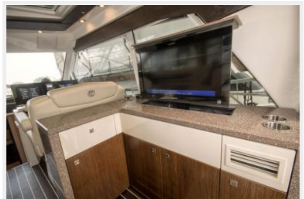
Upper Salon- Pop-up TV