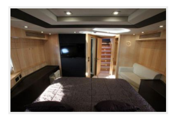
2012 Sunseeker 88 Yacht - Forward VIP