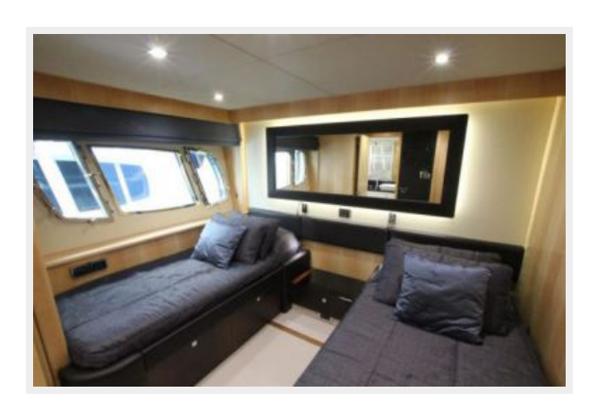
2012 Sunseeker 88 Yacht- Twin Cabin