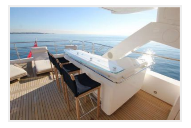
2012 Sunseeker 88 Yacht - Flybridge Bar