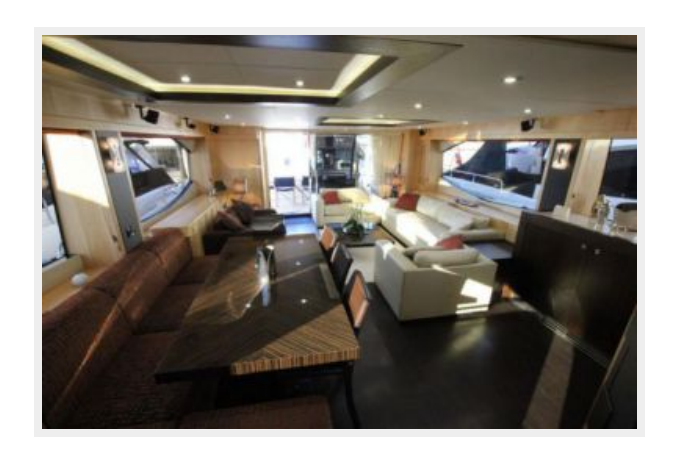
2012 Sunseeker 88 Yacht - Saloon Looking Aft