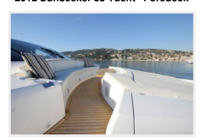
2012 Sunseeker 88 Yacht - Foredeck