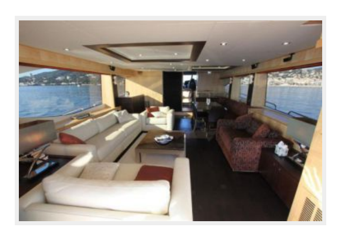
2012 Sunseeker 88 Yacht - Saloon Looking Forward