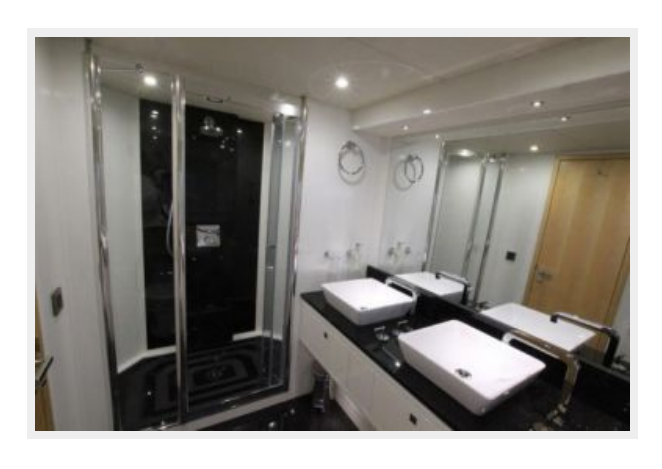
2012 Sunseeker 88 Yacht - Master En Suite