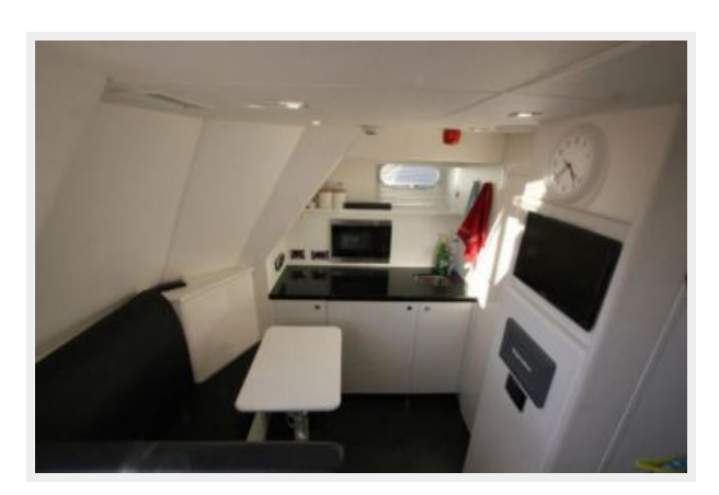
2012 Sunseeker 88 Yacht - Crew Bunk