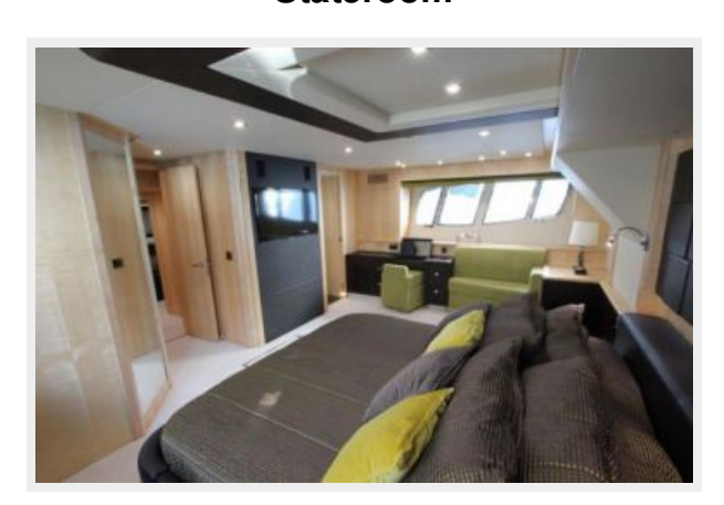
2012 Sunseeker 88 Yacht - Master Stateroom