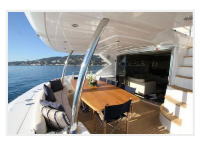
2012 Sunseeker 88 Yacht - Aft Deck