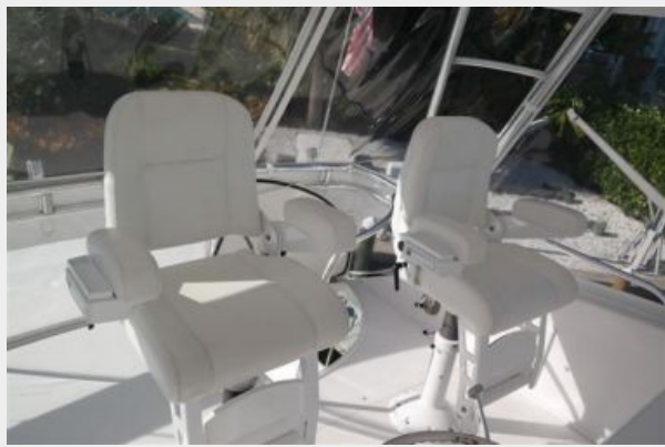
Stidd Helm Chairs