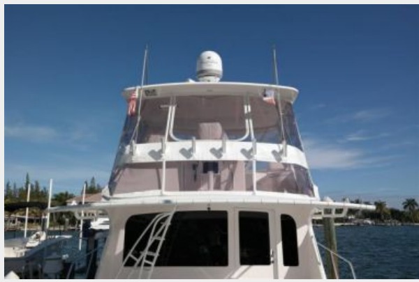
4 Sided Enclosure