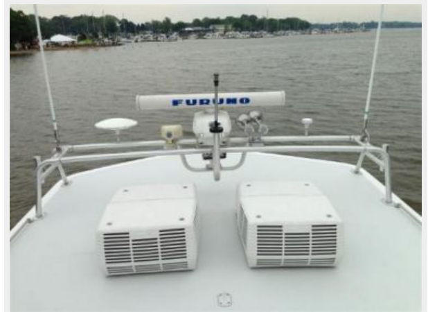
Rooftop with Custom Electronics Arch