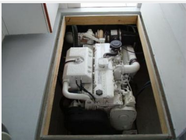
Common Rail Cummins