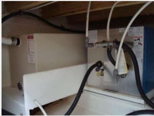
Freshwater Tank and Hot Water