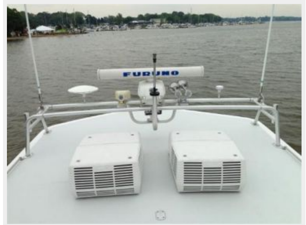
Rooftop with Custom Electronics Arch