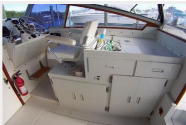
Sink area and lots of Storage