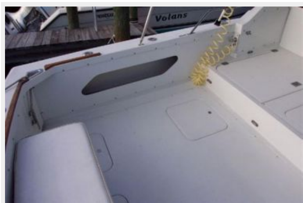
Cockpit to port