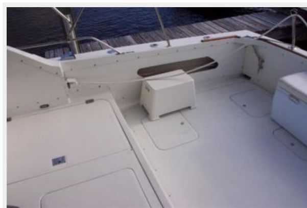
Cockpit to starboard