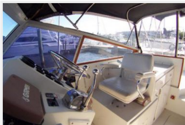
Helm to starboard