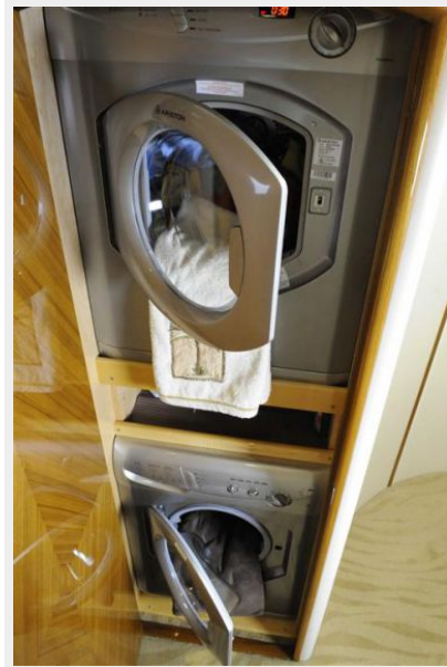
Washer and Dryer