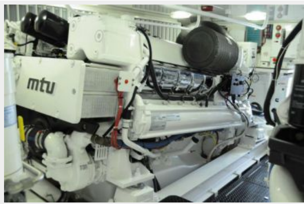
MTU 16V2000M94 2600 HP