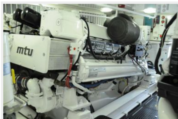
MTU 16V2000M94 2600 HP