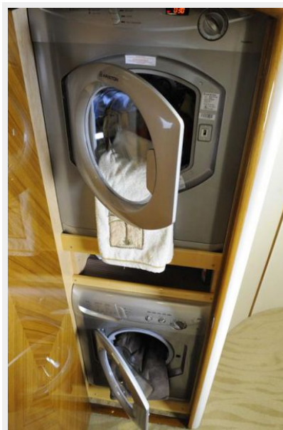
Washer and Dryer