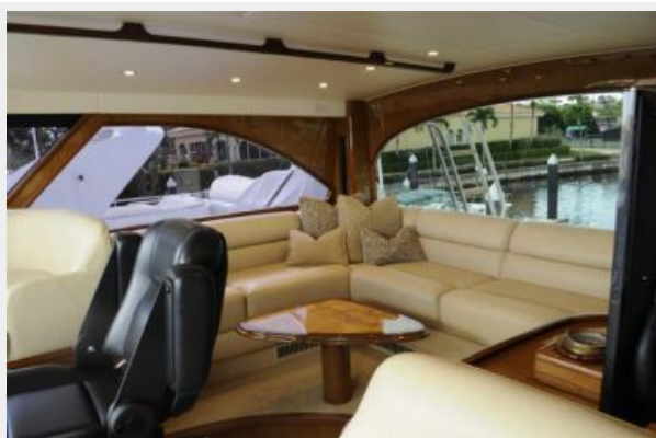
Enclosed Bridge Sofa