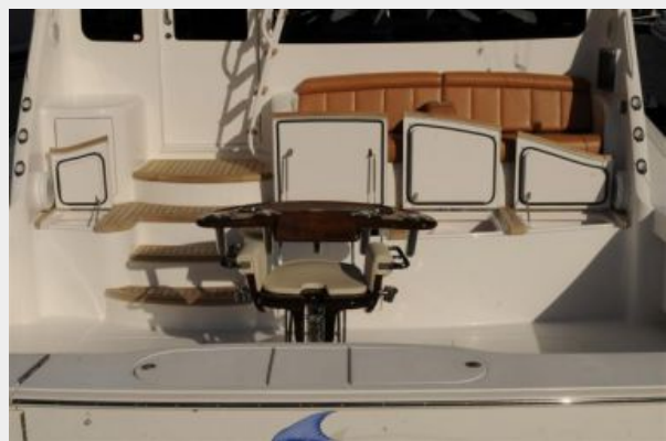
Mezzanine Refrigeration Boxes