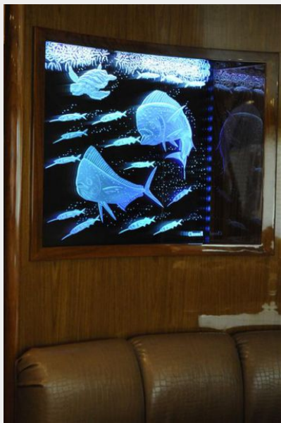
Salon Etched Glass Aft Window