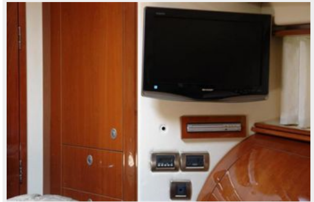
Vip Stateroom Fwd