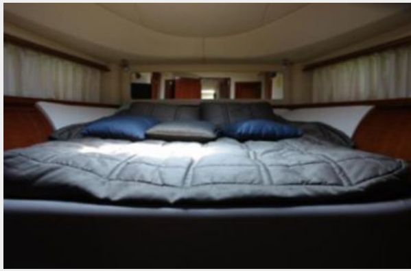
VIP Stateroom Fwd