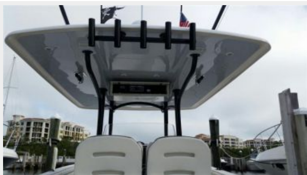
Top (Custom Painted Underside)