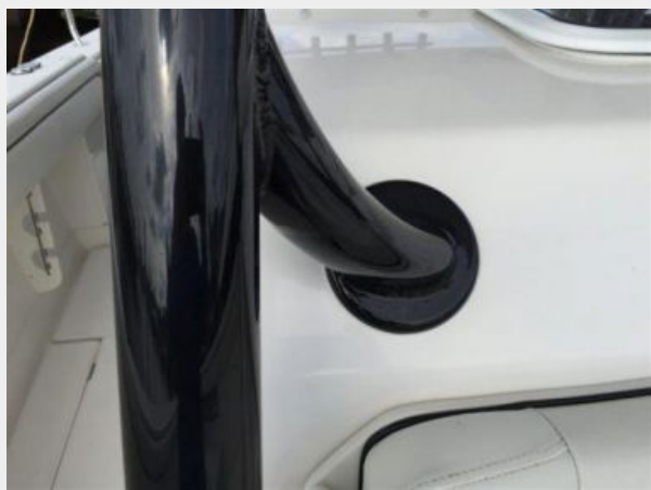
Black Powder Coated Fastener Free T-Top