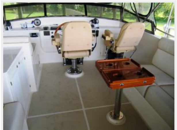
Flybridge- Optional Helm Seating