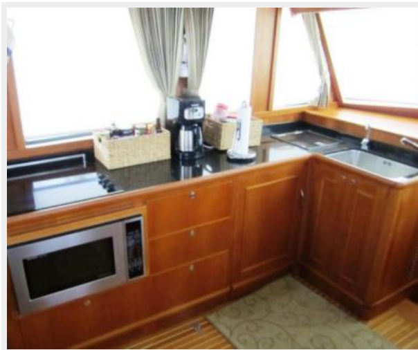
Galley in Salon