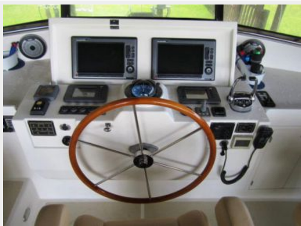
Upper Helm and Electronics