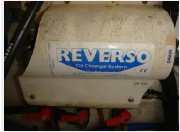
46' Alden oil change system