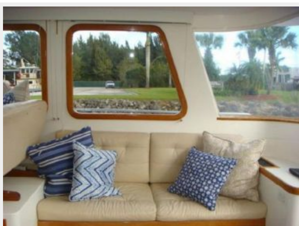
46' Alden upper deck starboard