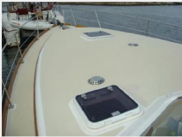
46' Alden foredeck