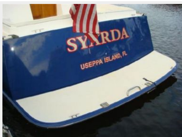
46' Alden swimplatform