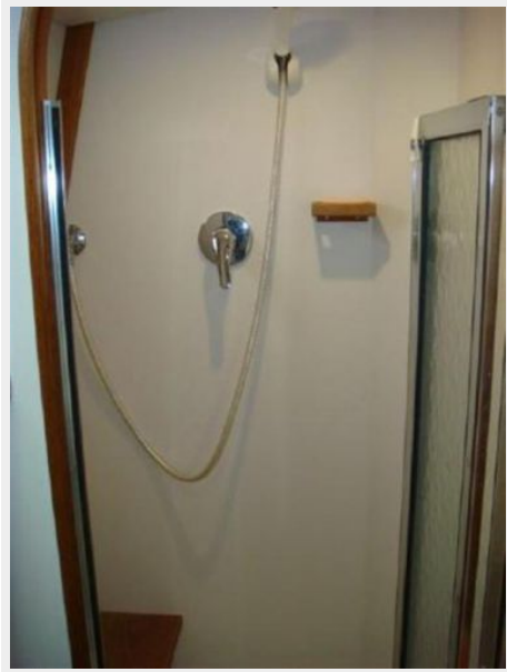
46' Alden guest shower