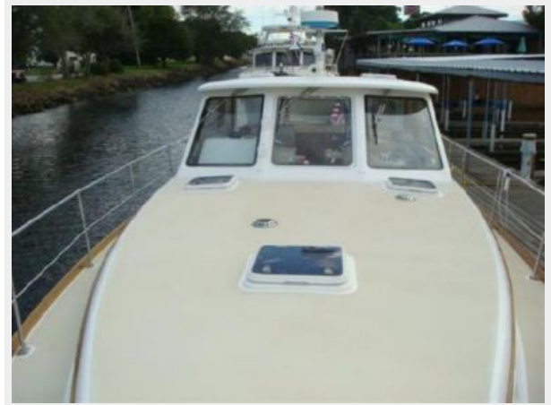
46' Alden foredeck aft