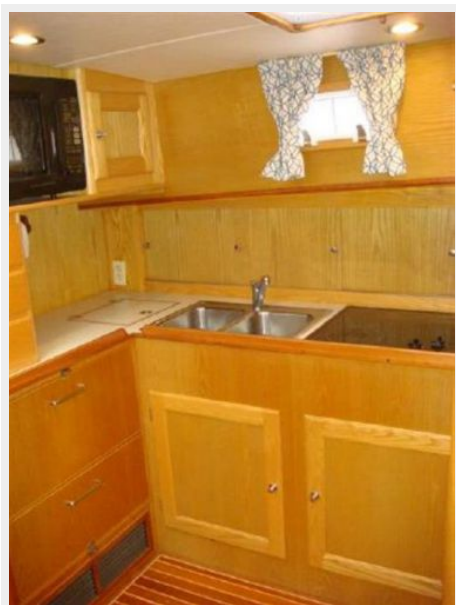
46' Alden galley