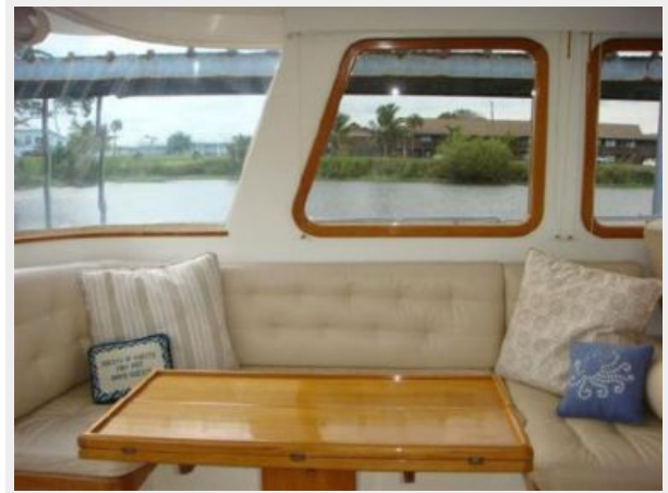
46' Alden upper deck port