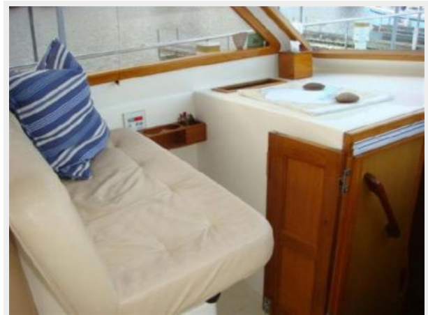
46' Alden upper deck port forward