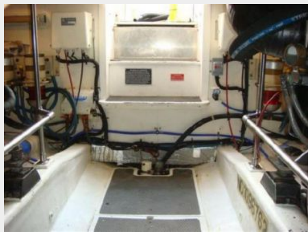
46' Alden engine room aft