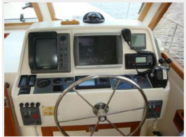
46' Alden helm photo2