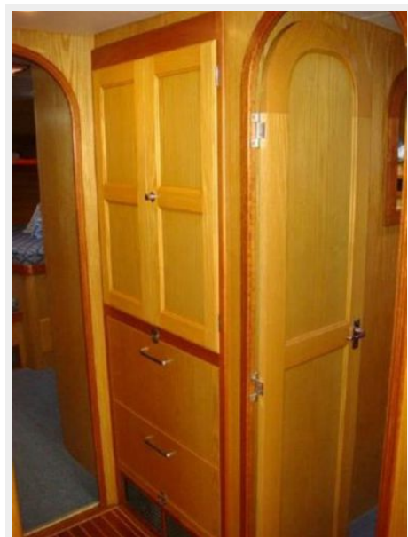
46' Alden galley starboard forward