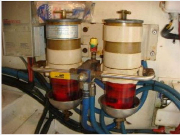
46' Alden starboard Racor fuel filters