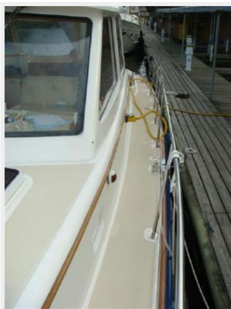
46' Alden port side deck photo1