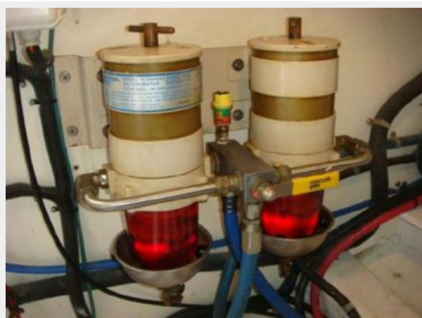
46' Alden port Racor fuel filters