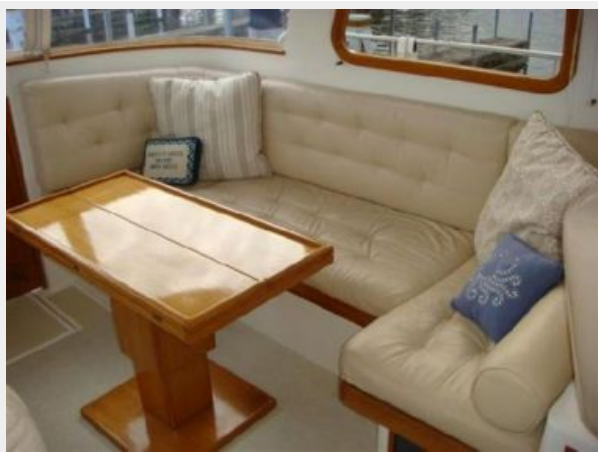
46' Alden upper deck port aft seating