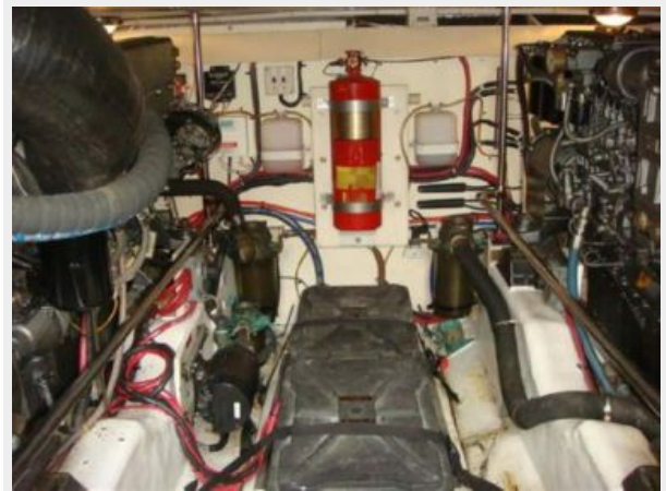
46' Alden engine room forward