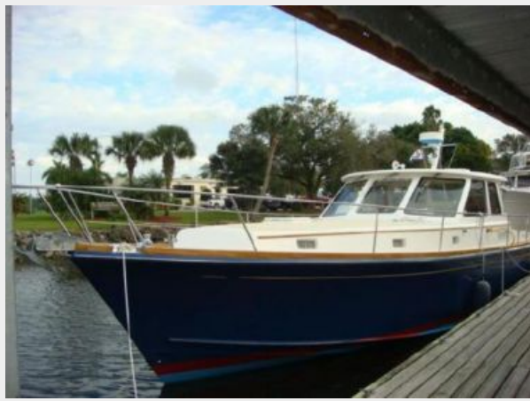
46' Alden port forward profile