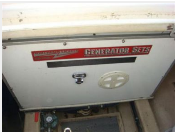
46' Alden generator