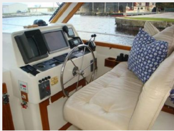
46' Alden helm photo1