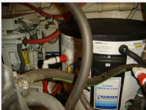
46' Alden water heater