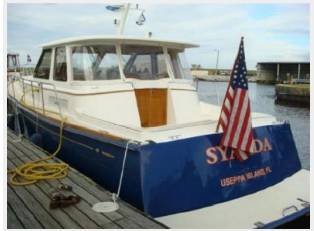
46' Alden port aft profile