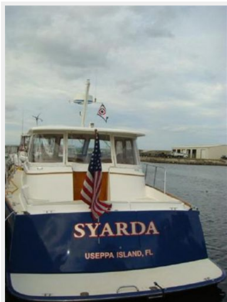
46' Alden aft profile