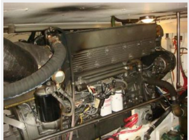
46' Alden port main engine