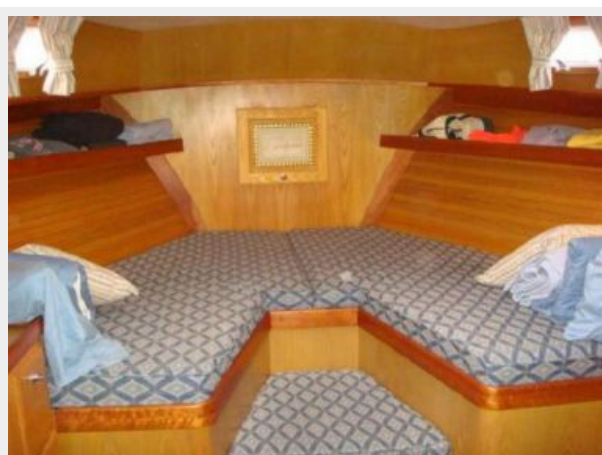
46' Alden master stateroom