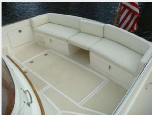
46' Alden cockpit photo1