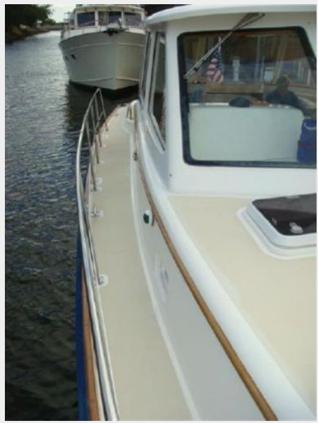
46' Alden starboard side deck photo1