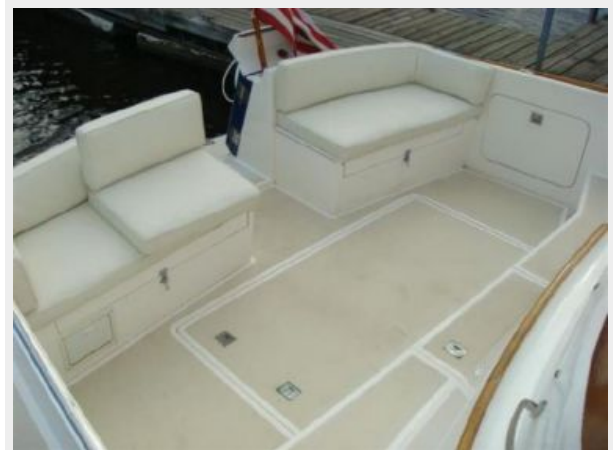
46' Alden cockpit photo2