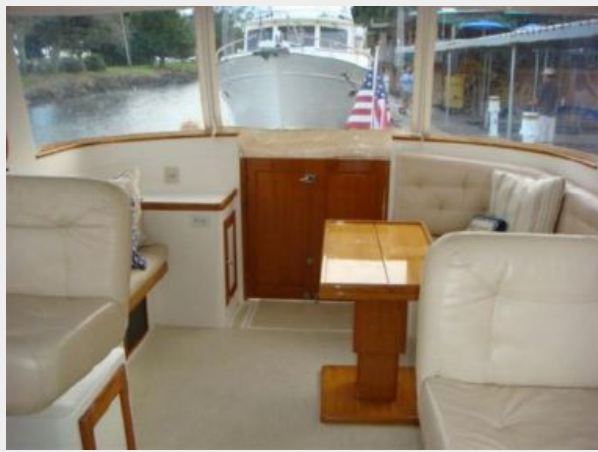
46' Alden upper deck aft