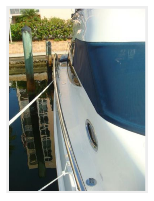
42' Sealine flybridge forward