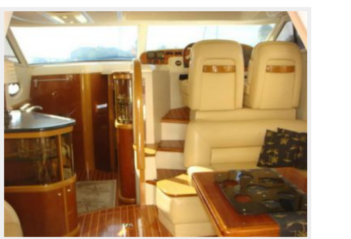
42' Sealine salon aft