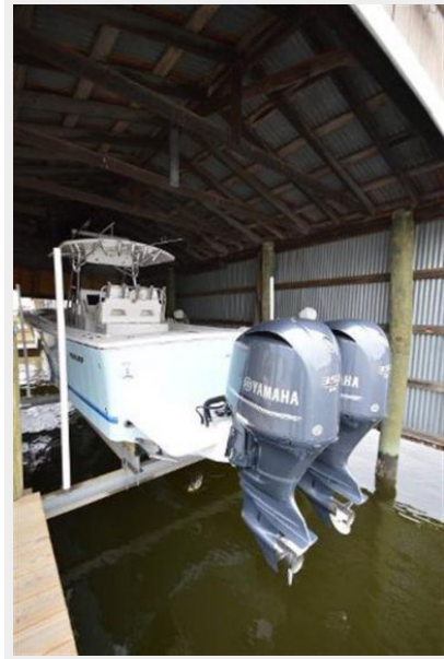
In Boathouse on Lift