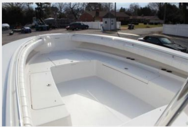
Forward Casting Area with Cushions Stowed Away