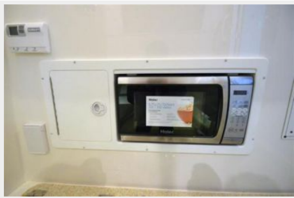
Microwave and A/C