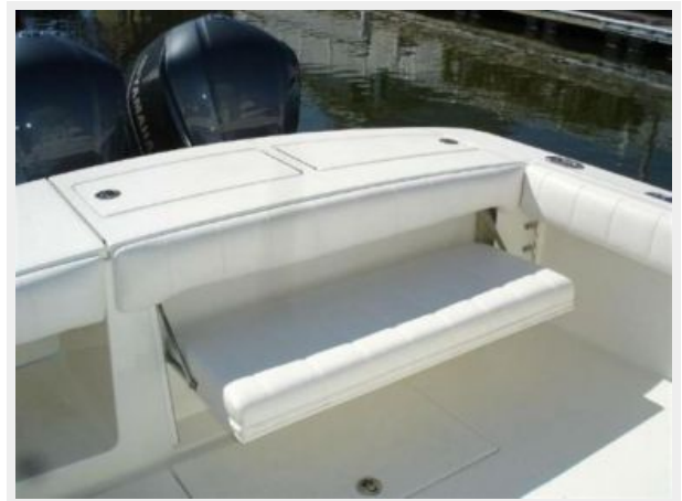
Transom Seat Down