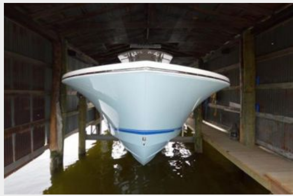
In Boathouse Flare