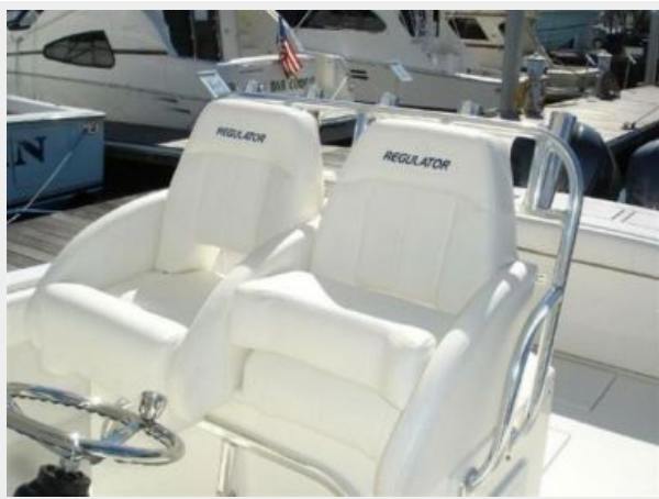
Helm Seating Two