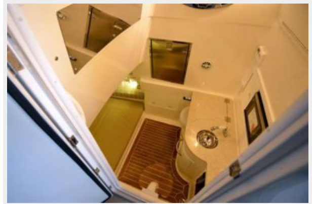
Cabin with A/C