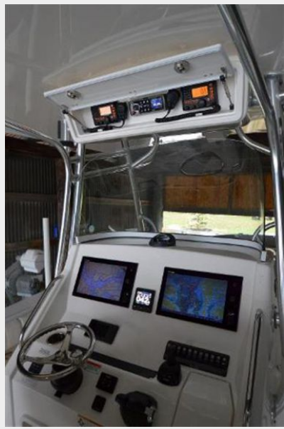
Helm with Electronics