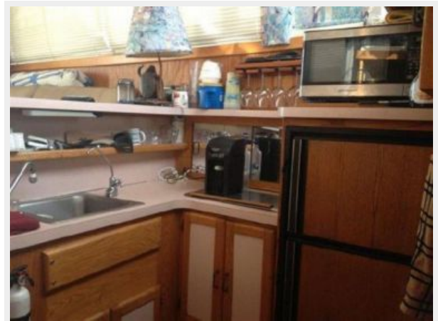
37' Silverton galley