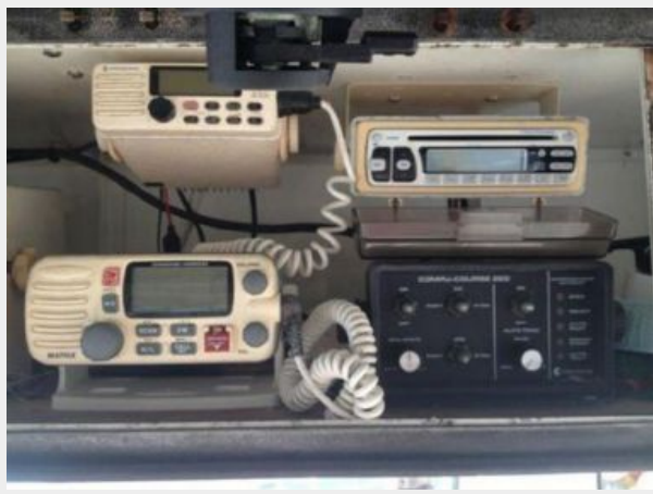
37' Silverton flybridge helm electronics photo1