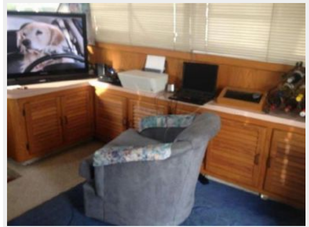
37' Silverton salon starboard