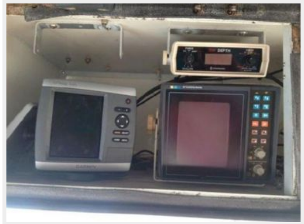
37' Silverton flybridge helm electronics photo2