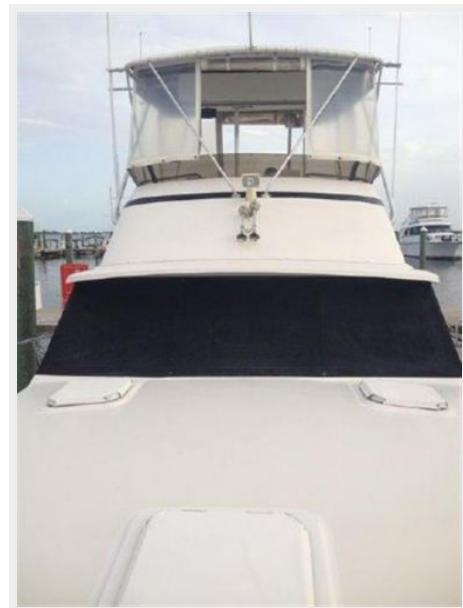
37' Silverton foredeck aft