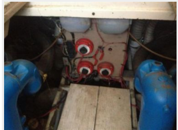
37' Silverton engine room