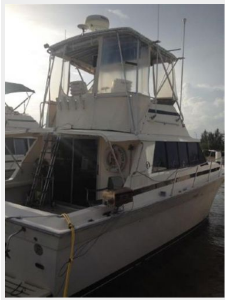
37' silverton starboard aft profile