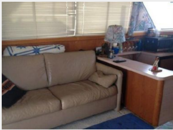
37' Silverton salon port