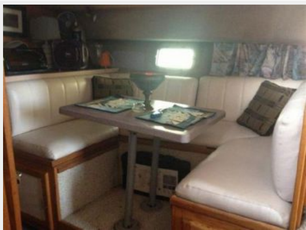
37' Silverton dinette