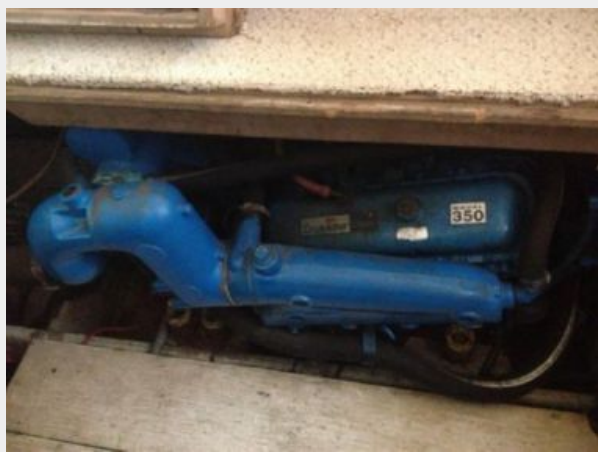
37' Silverton port main engine