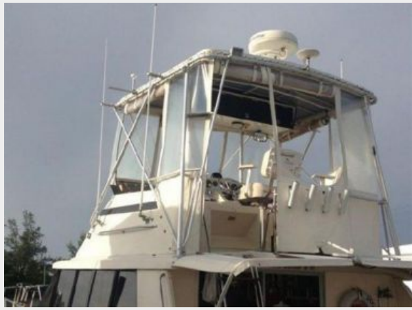
37' Silverton flybridge