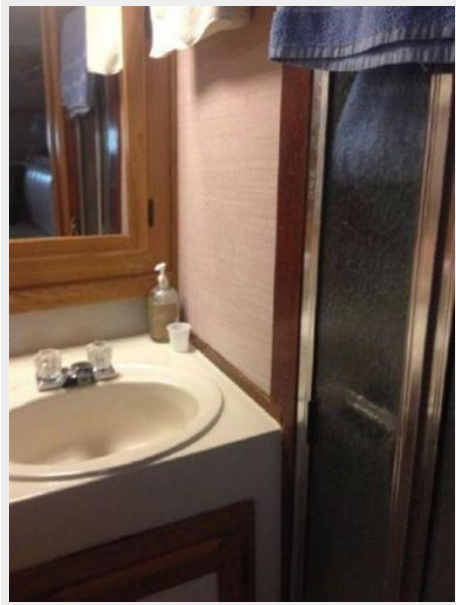
37' Silverton head photo2