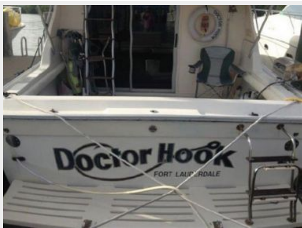
37' Silverton cockpit