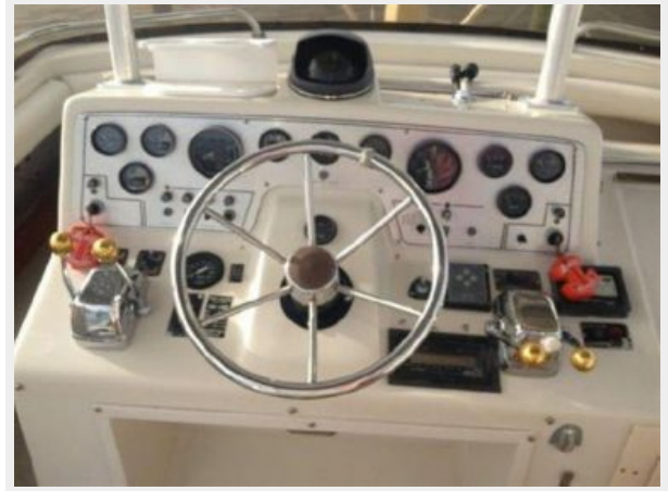
37' Silverton flybridge helm