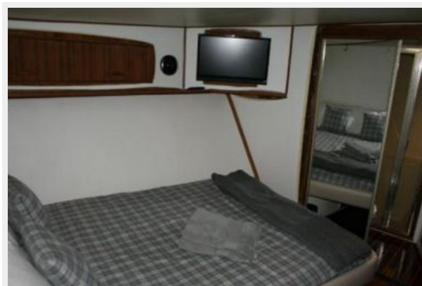
master with head full head forward