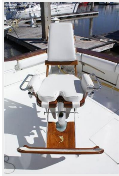
beautiful fighting chair