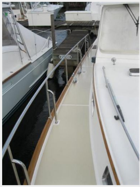
Starboard side deck