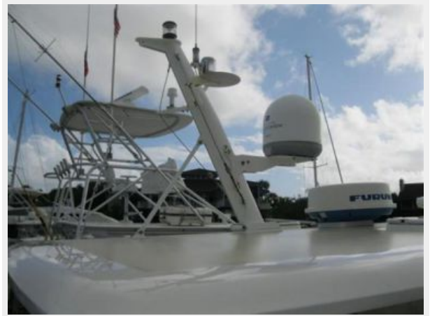
Mast and equipment