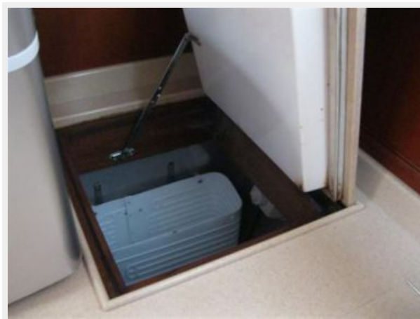
Adler Barber chest refrigerator.