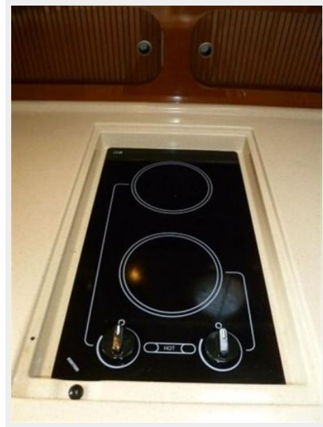
Two Burner Galley Cooktop