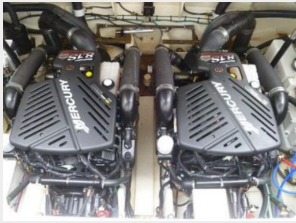
Clean Engine Room