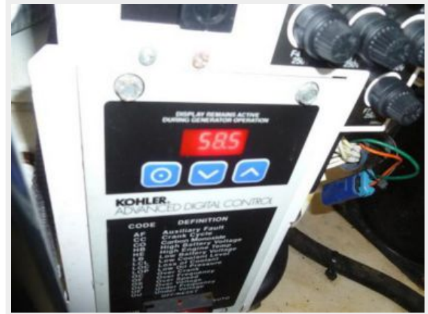
Kohler 5KW Generator