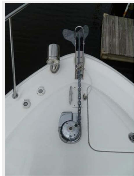
Anchor windlass and remote spot light